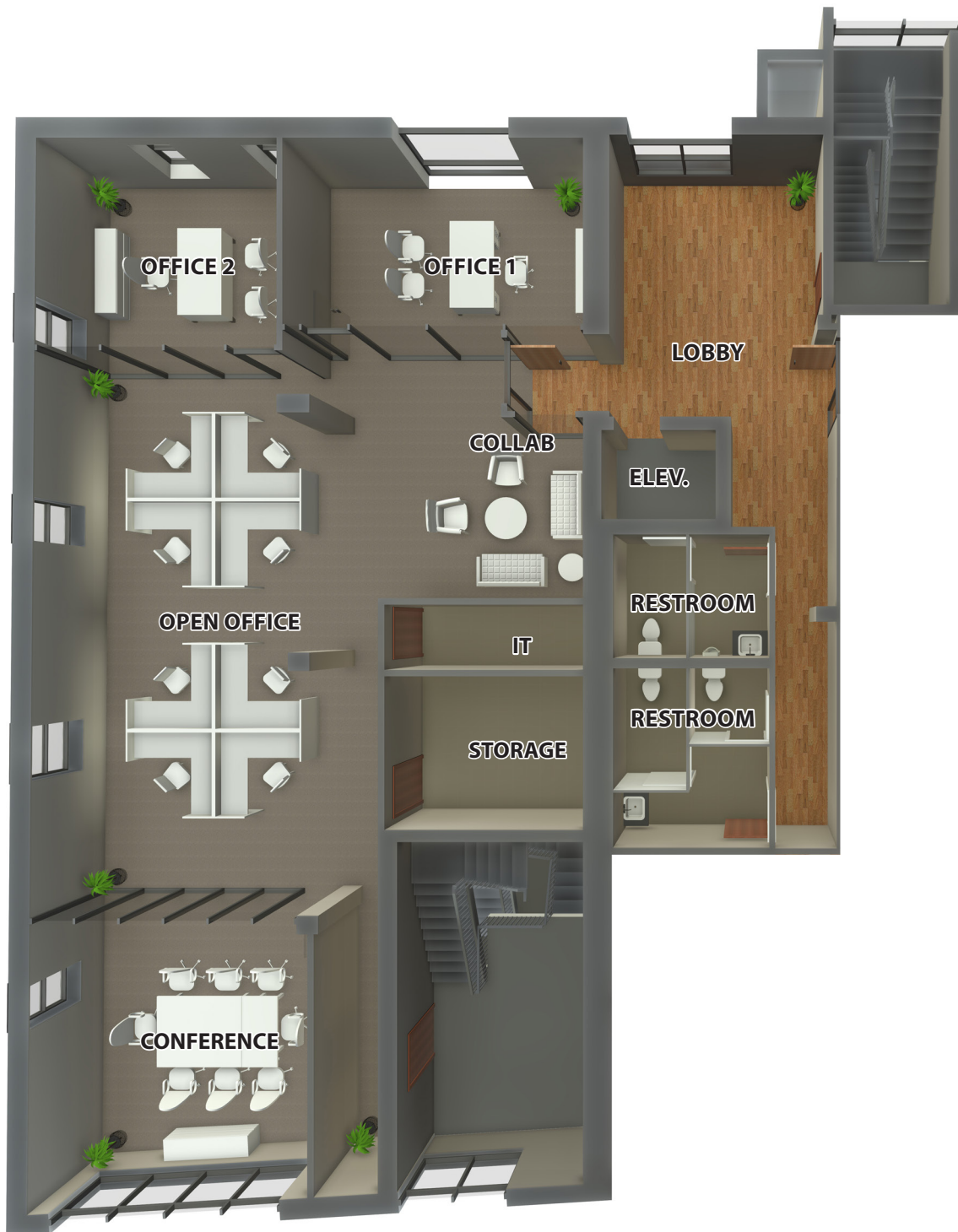
3D Leasing Plan with Sample Furniture