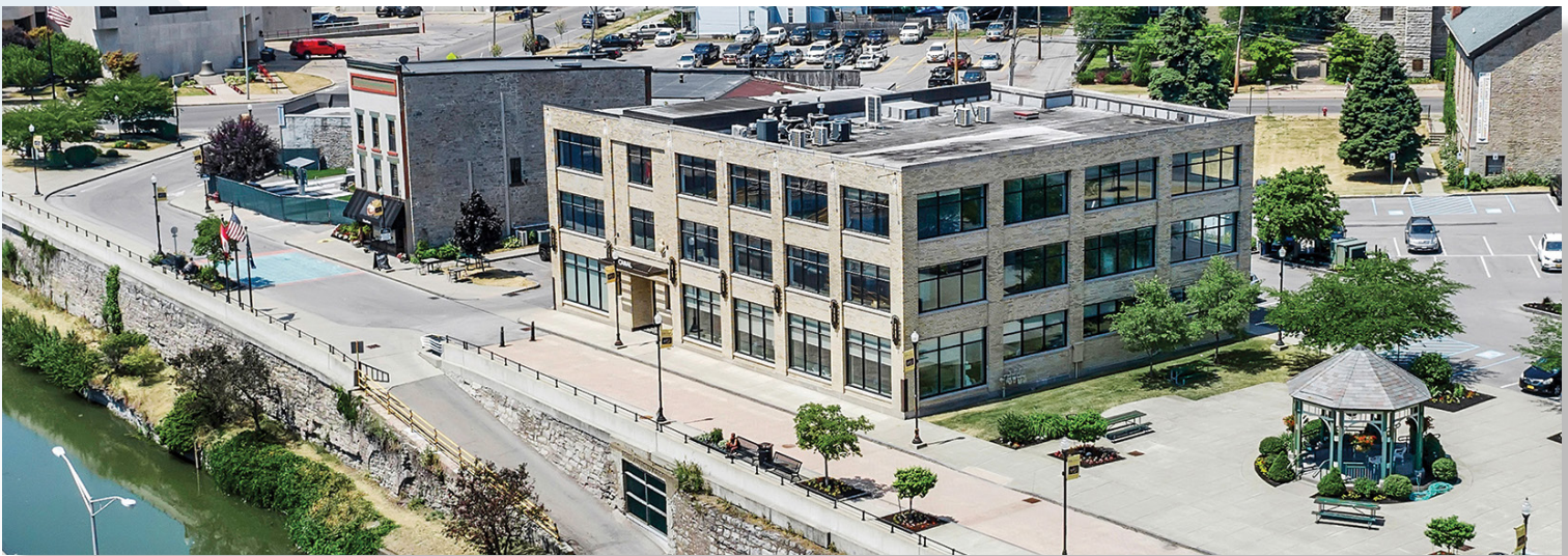
▲ BUILDING LOCATED ALONG ERIE CANAL

Improve your corporate image and revitalize your work environment with this fully renovated office space at 57 Canal Street.