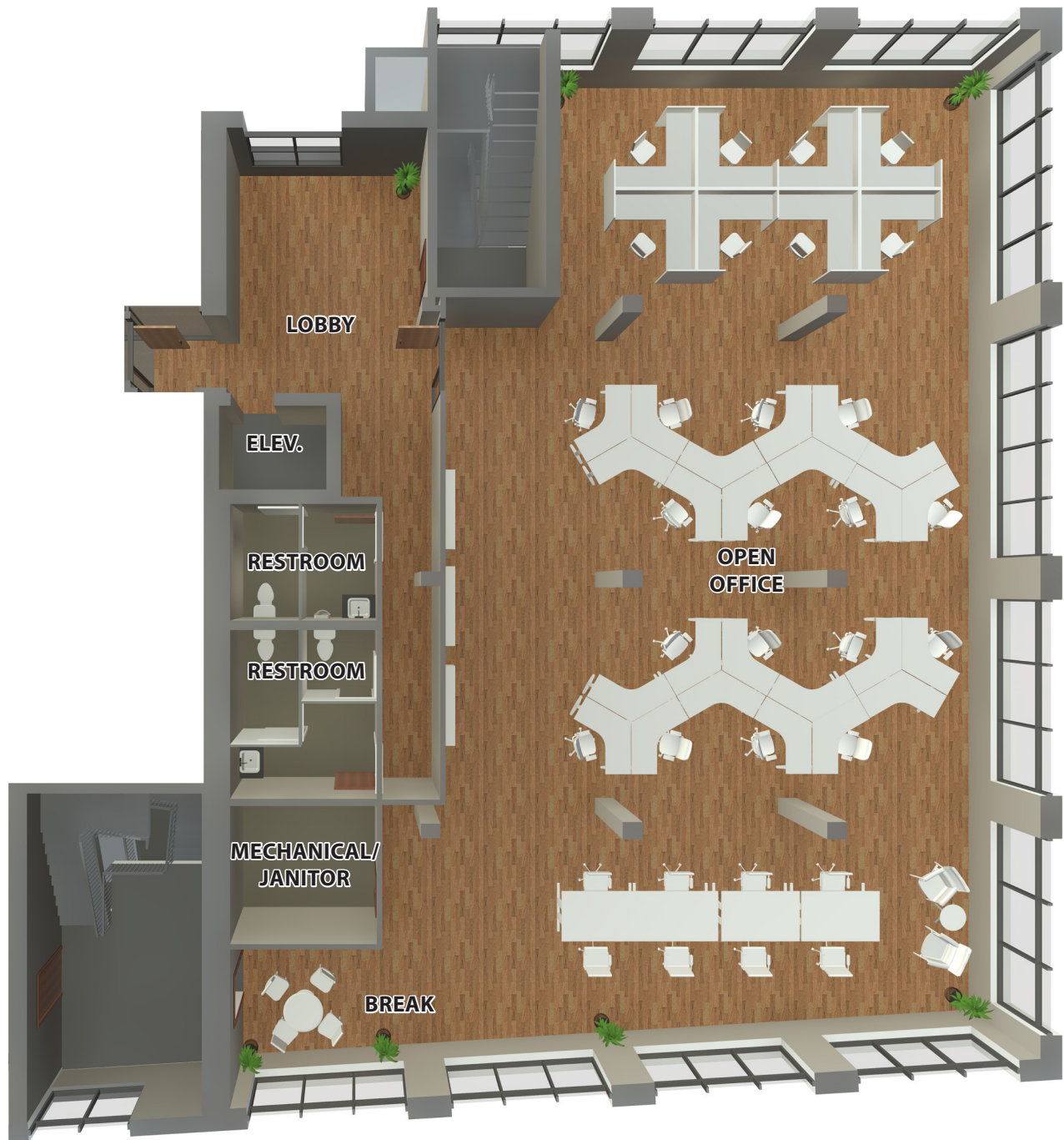
3D Leasing Plan with Sample Furniture