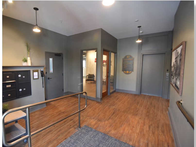
▲ FULLY RENOVATED INTERIOR