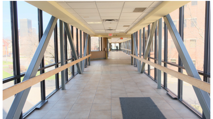
SKYWALK TO GARAGE