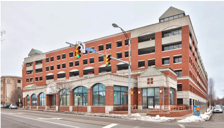
17,000 CAR GARAGE ONSITE