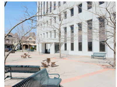
LARGE SHARED PATIO