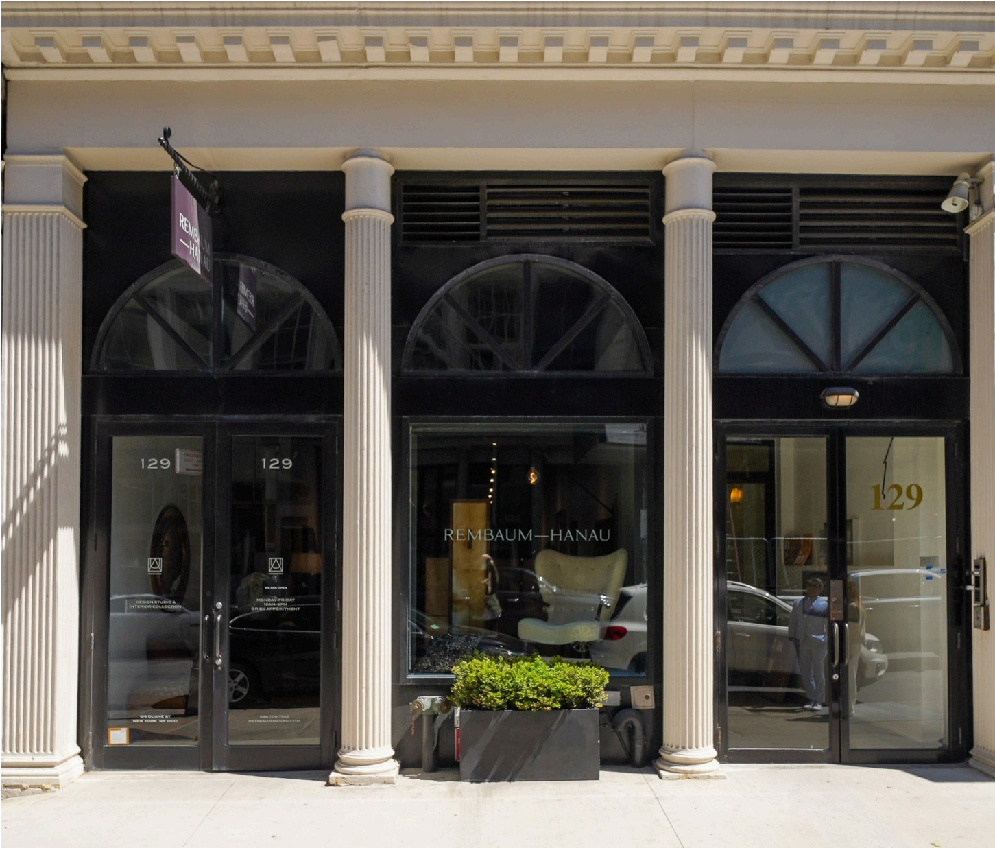
129 Duane Street 1250 SF-Ground Floor Retail In The Heart of Tribeca