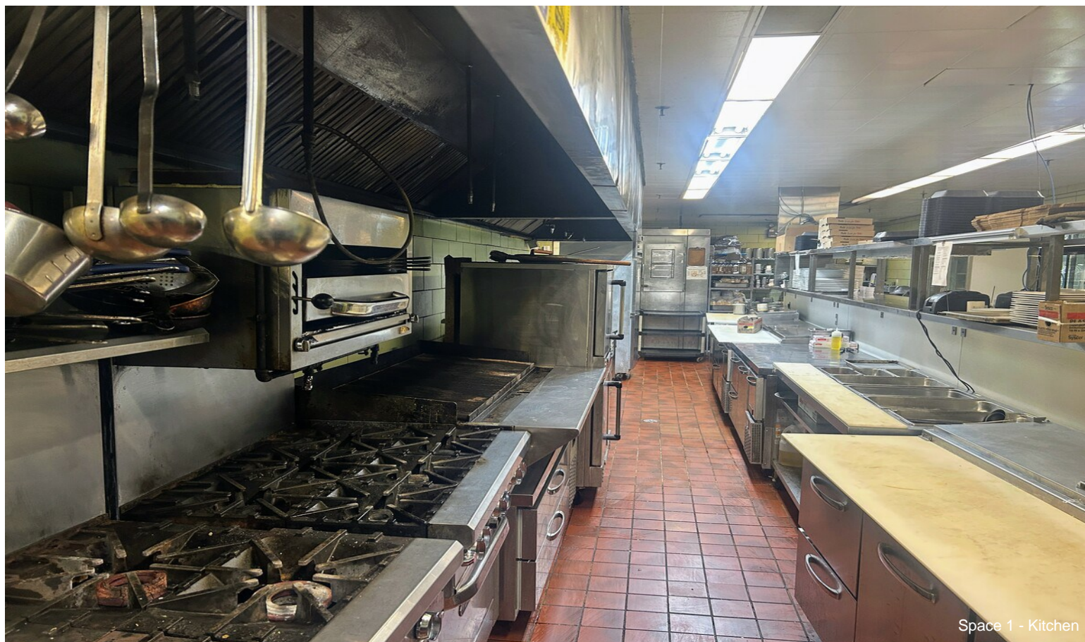
Space 1 - Kitchen