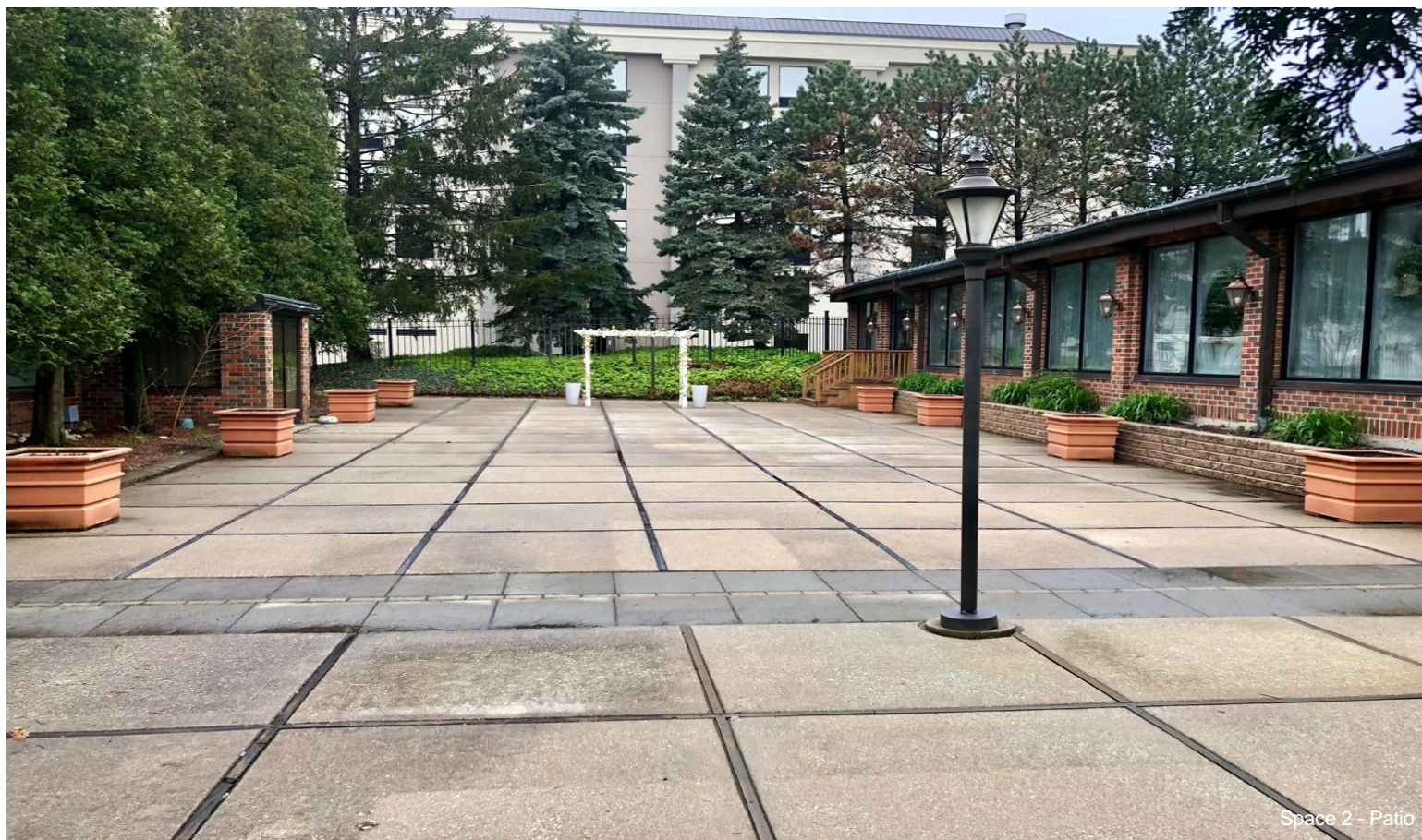
Space 2 - Patio