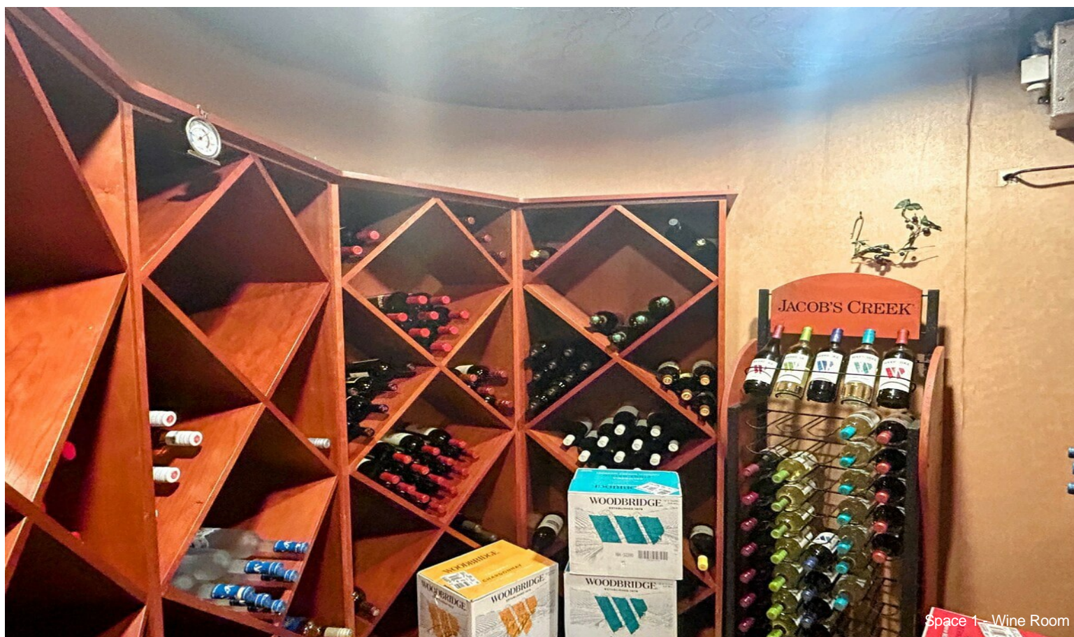
Space 1 - Wine Room