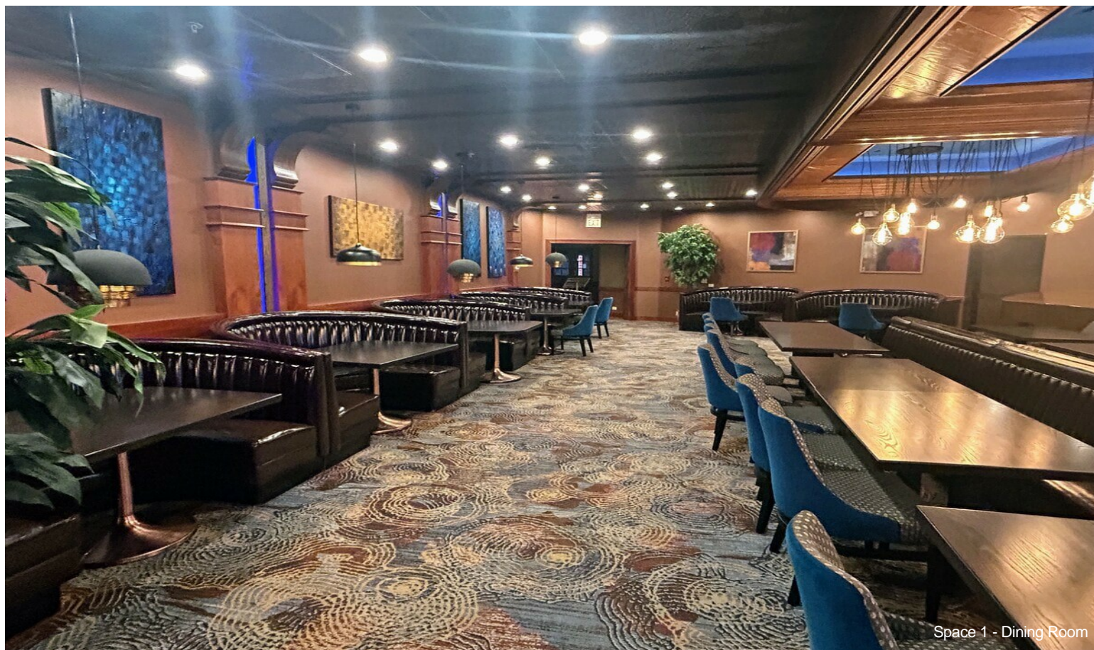
Space 1 - Dining Room