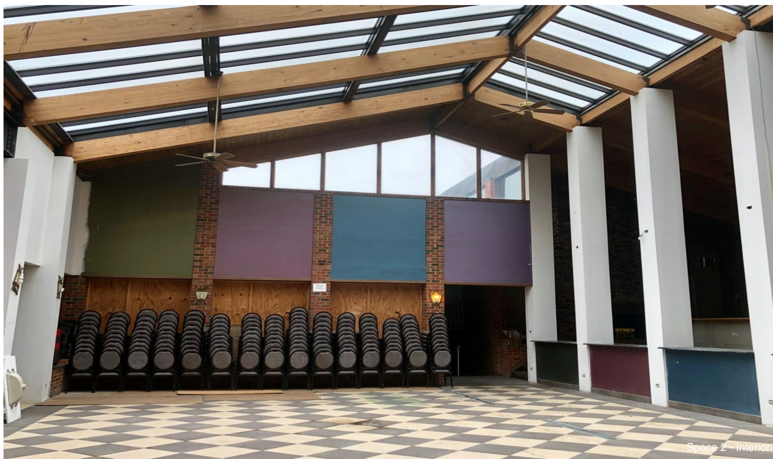
Space 2 - Interior