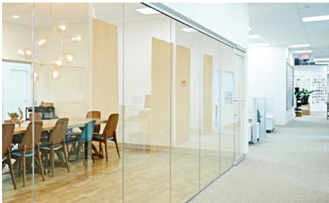
Single-story office interior build-out