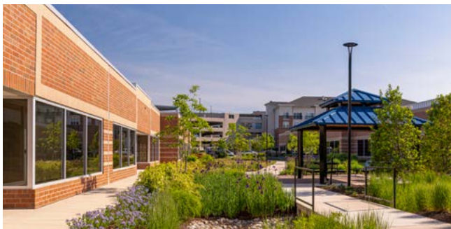
Green space amenity

In total Greenleigh will include 18 single-story office buildings, totaling more than 460,000 square feet of space. Tenant sizes range from 1,384 square feet to 40,800 square feet and offer businesses direct-entry 24/7 access. Green space amenities are abundant throughout the campus and include a putting green.