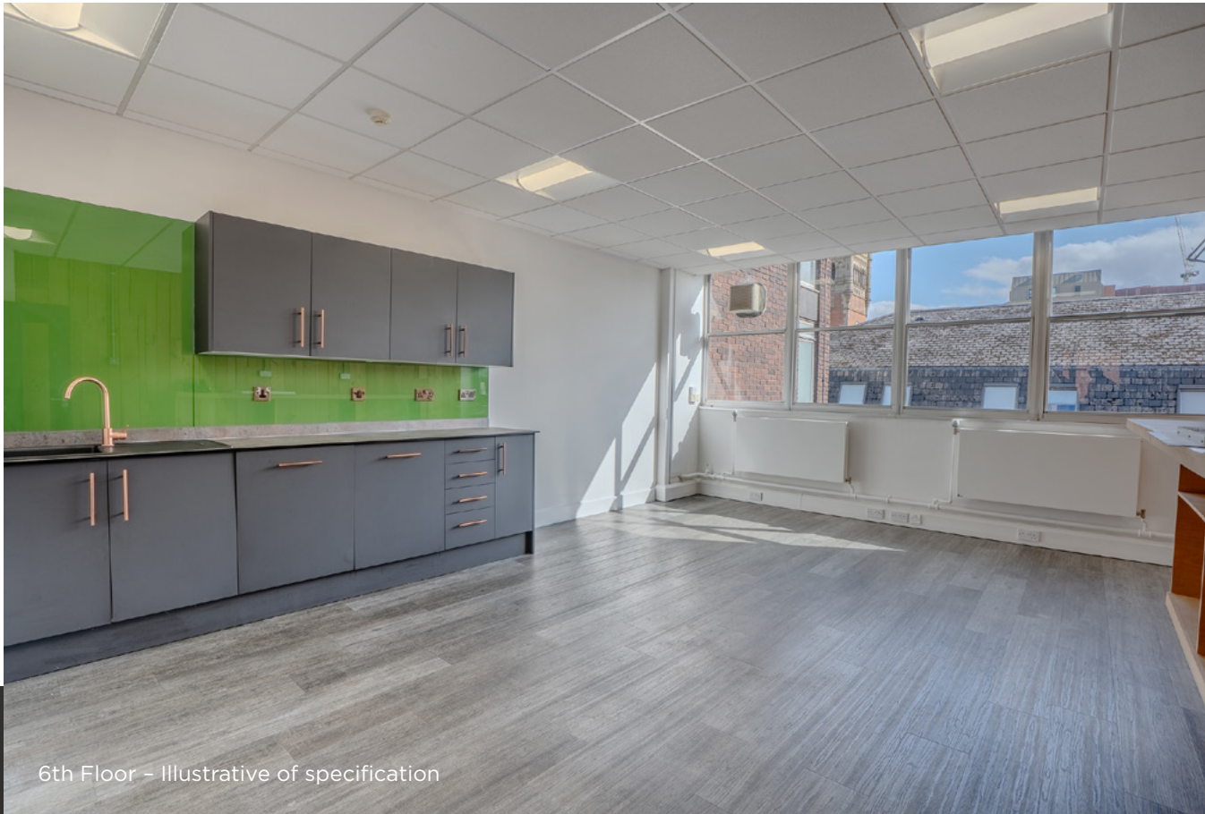
6th Floor - Illustrative of specification