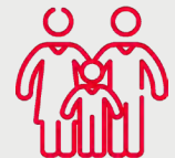
Number of Households