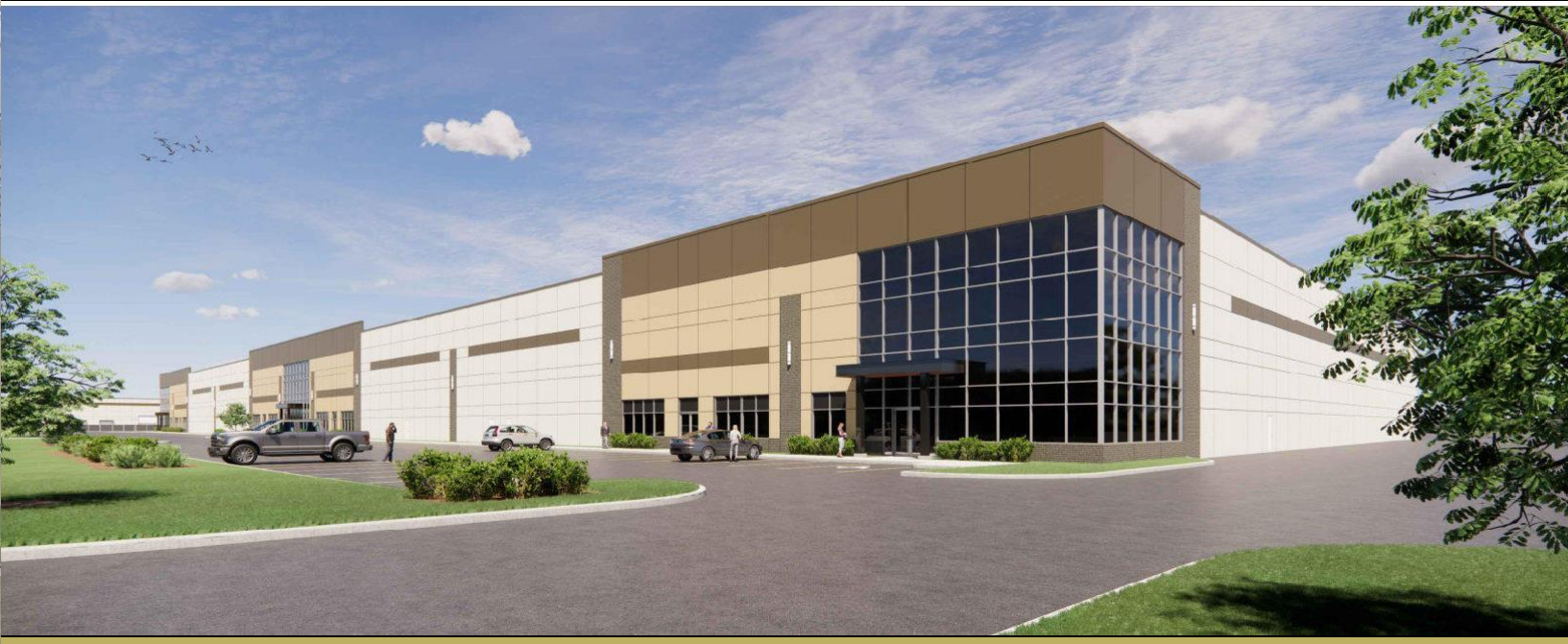
SOUTH EDMONTON'S NEWEST PREMIER DISTRIBUTION CENTRE