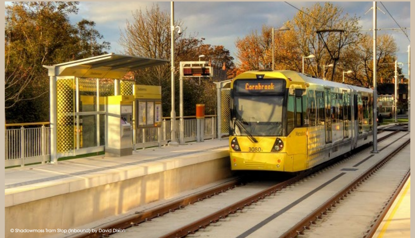
© Shadowmoss Tram Stop (Inbound) by David Dixon