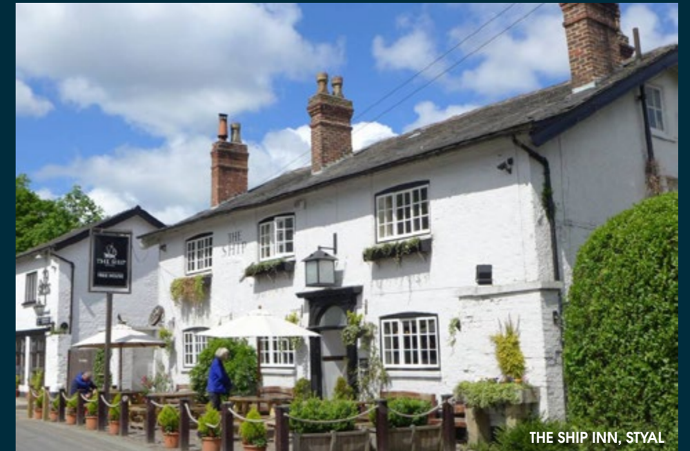
THE SHIP INN, STYAL