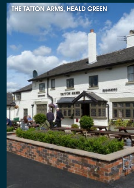
THE TATTON ARMS, HEALD GREEN