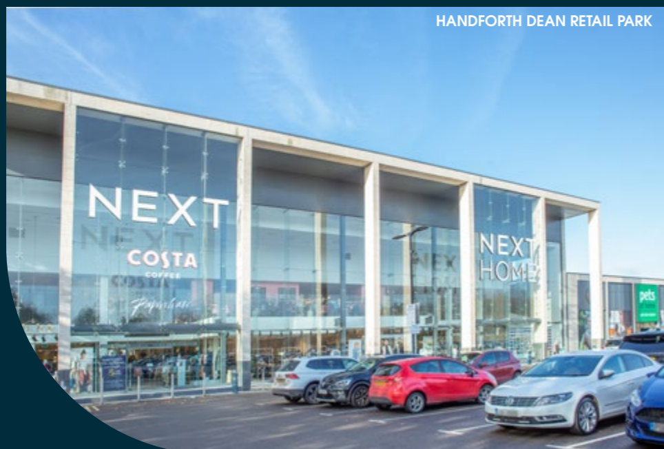
HANDFORTH DEAN RETAIL PARK