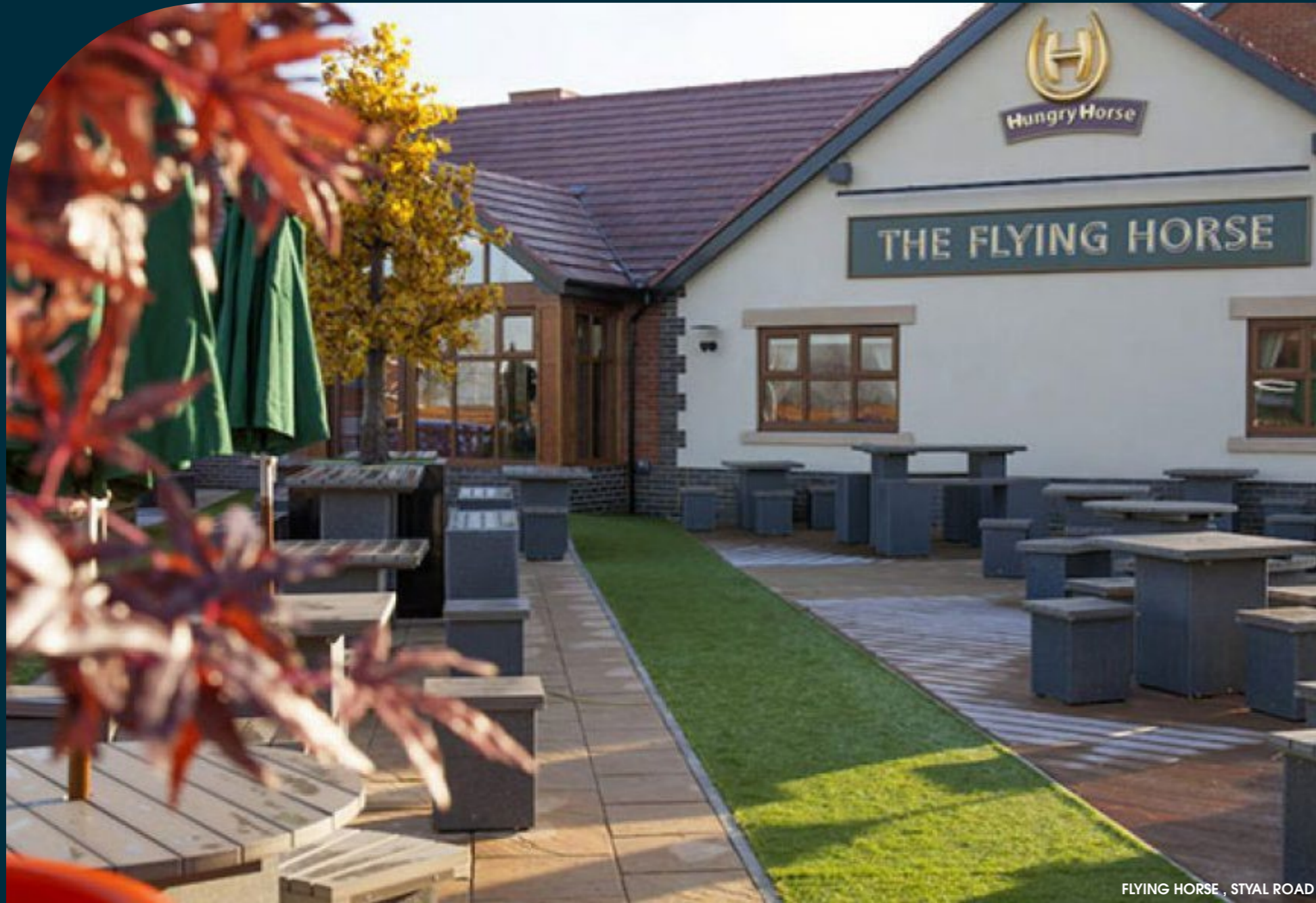
FLYING HORSE , STYAL ROAD