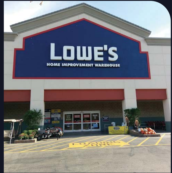
Anchored by Lowe's