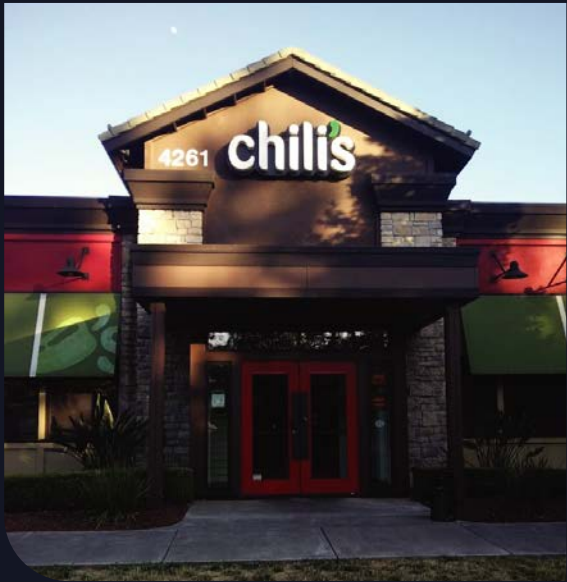
Neighboring tenant Chili's