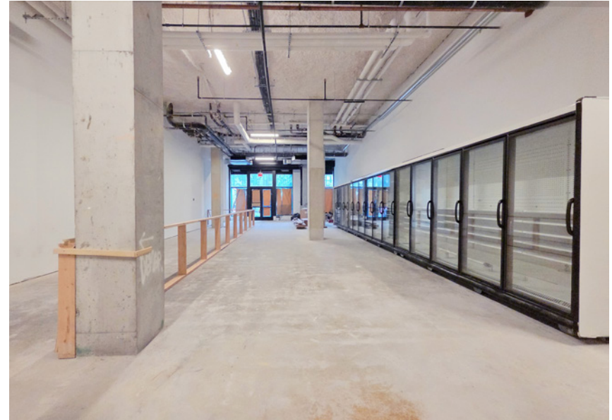
Store 2 - Existing Conditions