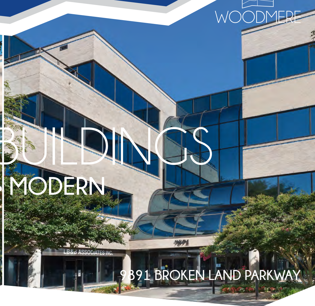
9891 BROKEN LAND PARKWAY

Woodmere is a premier Class A office park in a strategically located area. The buildings total 125,000 SF and are currently undergoing capital improvements to provide more value to its tenants. Woodmere is right off Route 32 with easy access to Downtown Columbia and I-95. Tenants can take advantage of modern and well-maintained office spaces with extensive window lines and an abundance of free parking.