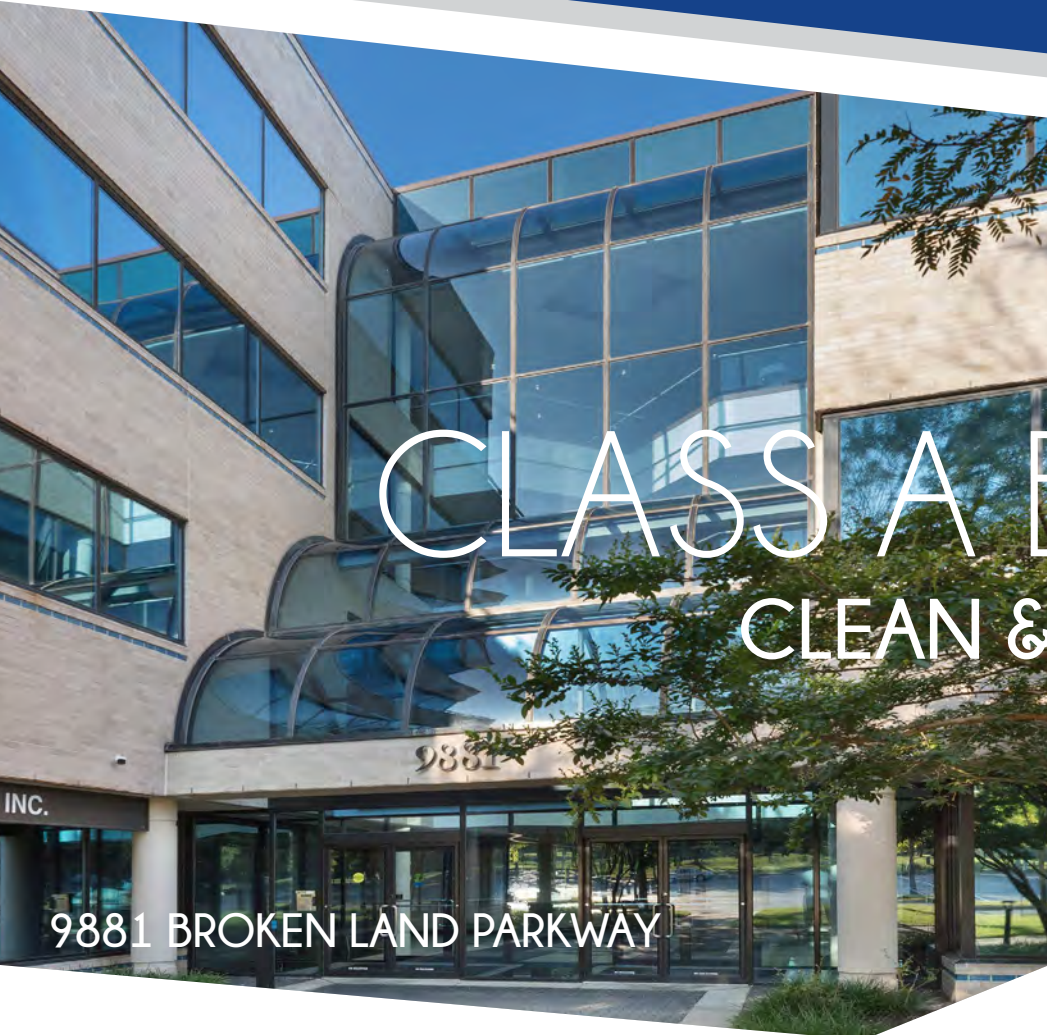
9881 BROKEN LAND PARKWAY