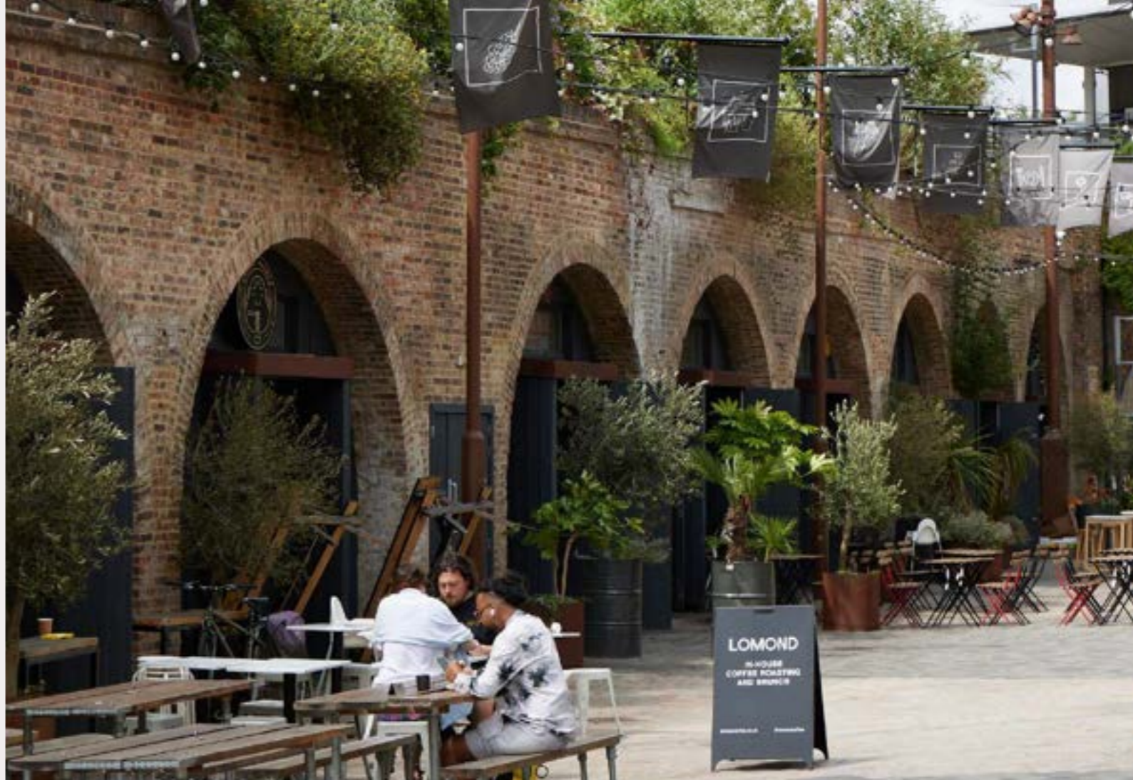
↑ HORNIMAN MUSEUM ↓ CHICHA RESTAURANT ↑ THE ALBANY THEATRE ↓ LEWISHAM ARTHOUSE ↑ DEPTFORD MARKET YARD ↓ BUSTER MANTIS