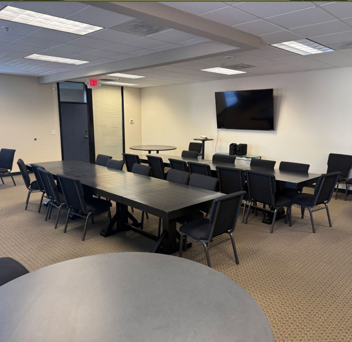
Professional Office in the heart of Willow Glen