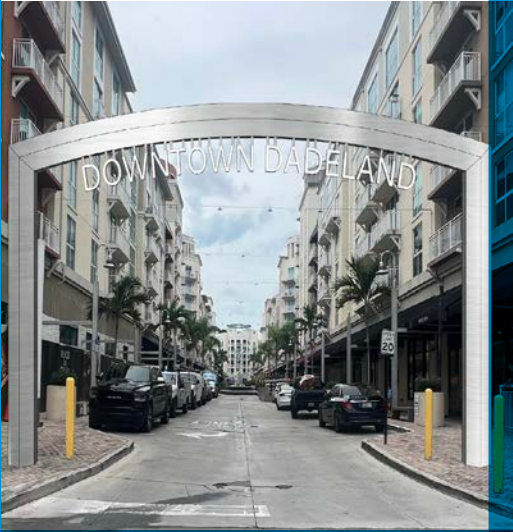
Proposed Monument Signage