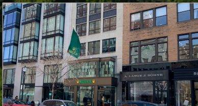
8 NEWBURY - ROLEX