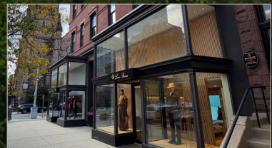
43 NEWBURY - LORO PIANA