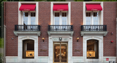
28 NEWBURY - CARTIER FLAGSHIP