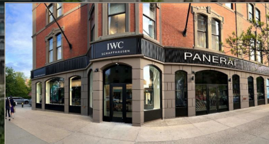
2 NEWBURY - IWC & PANERAI