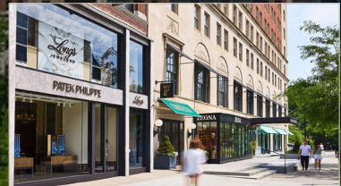
7 NEWBURY - PATEK PHILIPPE