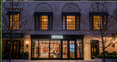
1 NEWBURY - ZEGNA

LUXURY BRAND PRESENCE ON BOSTON'S MOST PRESTIGIOUS BLOCK