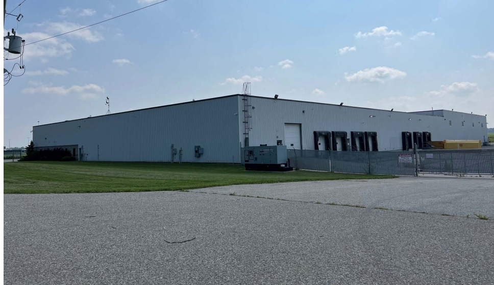
FLOW THROUGH SHIPPING