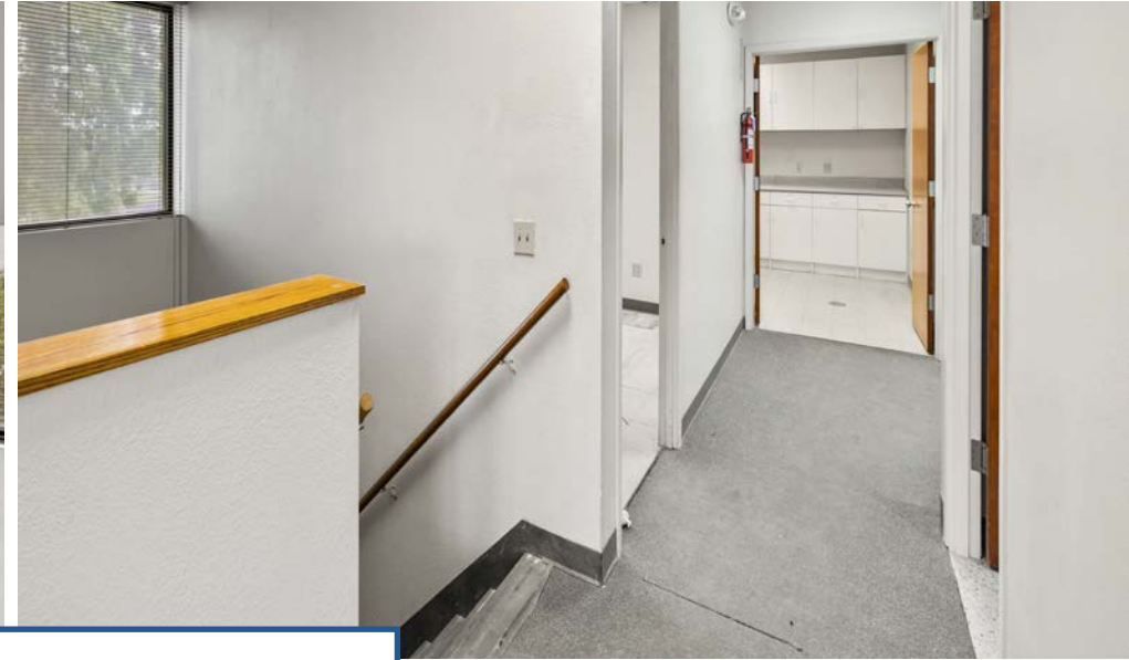
SECOND FLOOR OFFICE SPACE