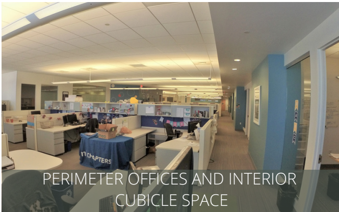
PERIMETER OFFICES AND INTERIOR CUBICLE SPACE