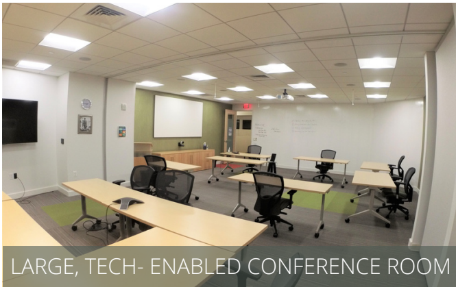
LARGE, TECH-ENABLED CONFERENCE ROOM