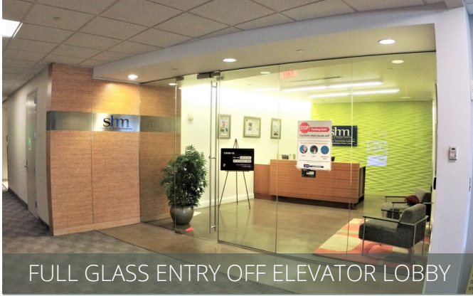
FULL GLASS ENTRY OFF ELEVATOR LOBBY