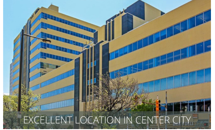
EXCELLENT LOCATION IN CENTER CITY