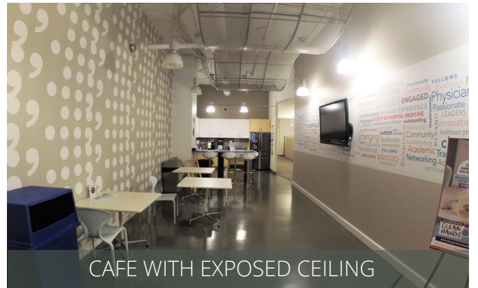
CAFE WITH EXPOSED CEILING