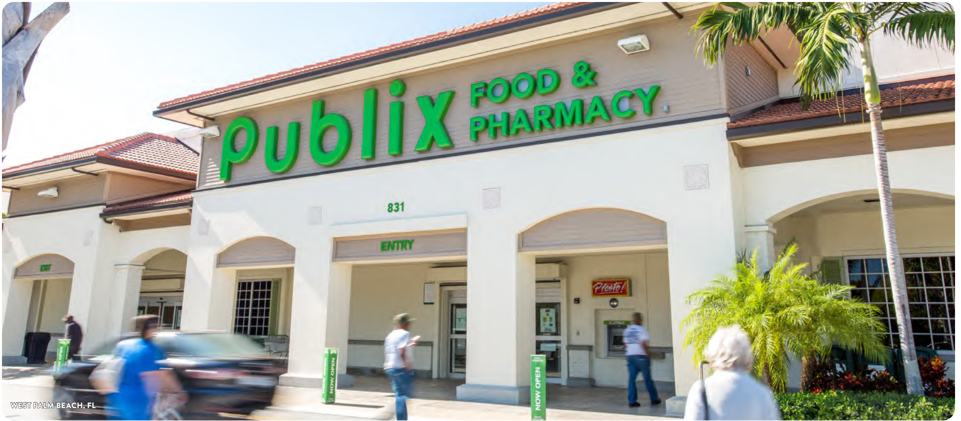
WEST PALM BEACH, FL