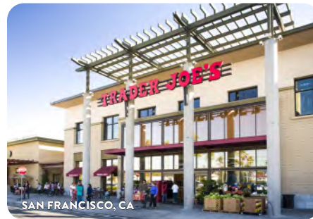
SAN FRANCISCO, CA