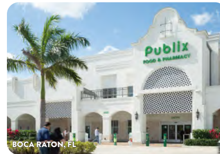
BOCA RATON, FL