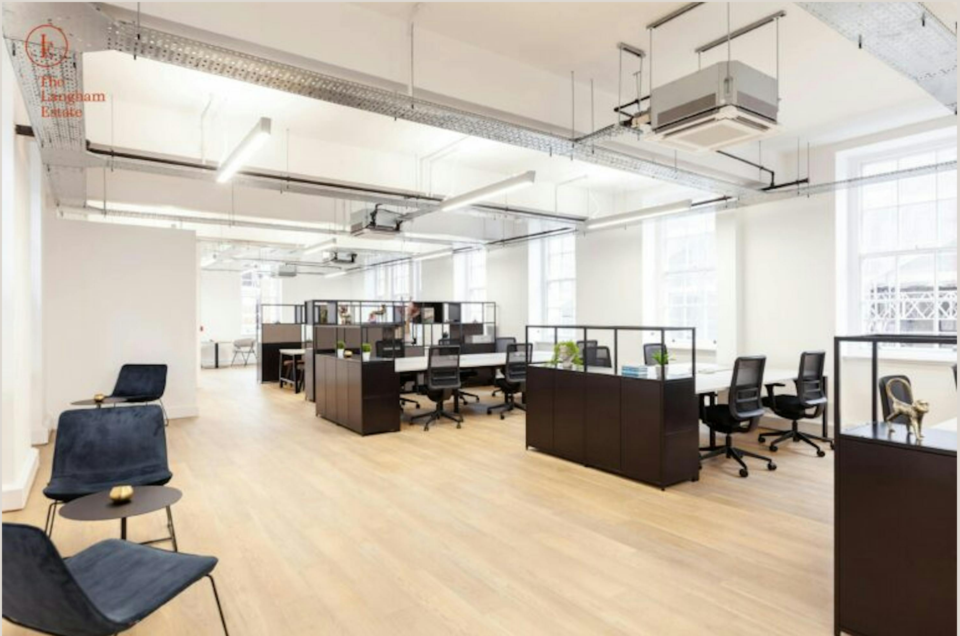
Portland House - 4 Great Portland Street