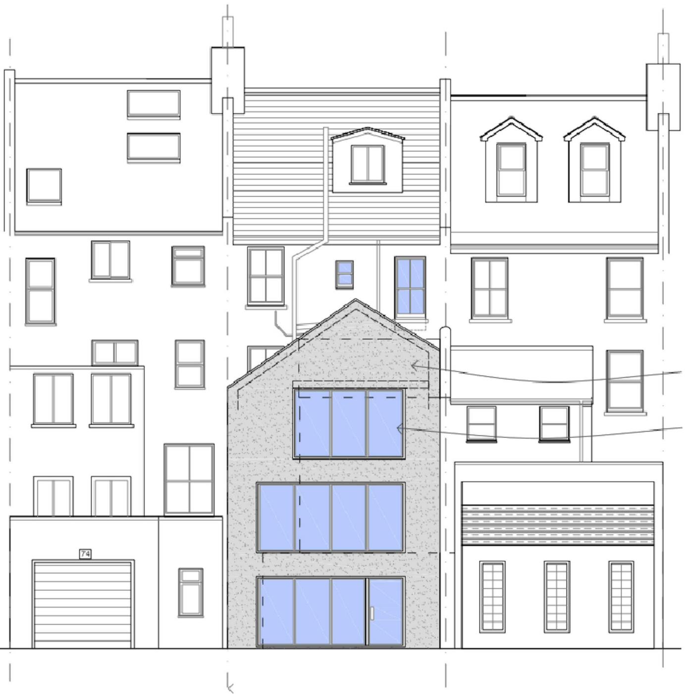
Rear (West) Elevation