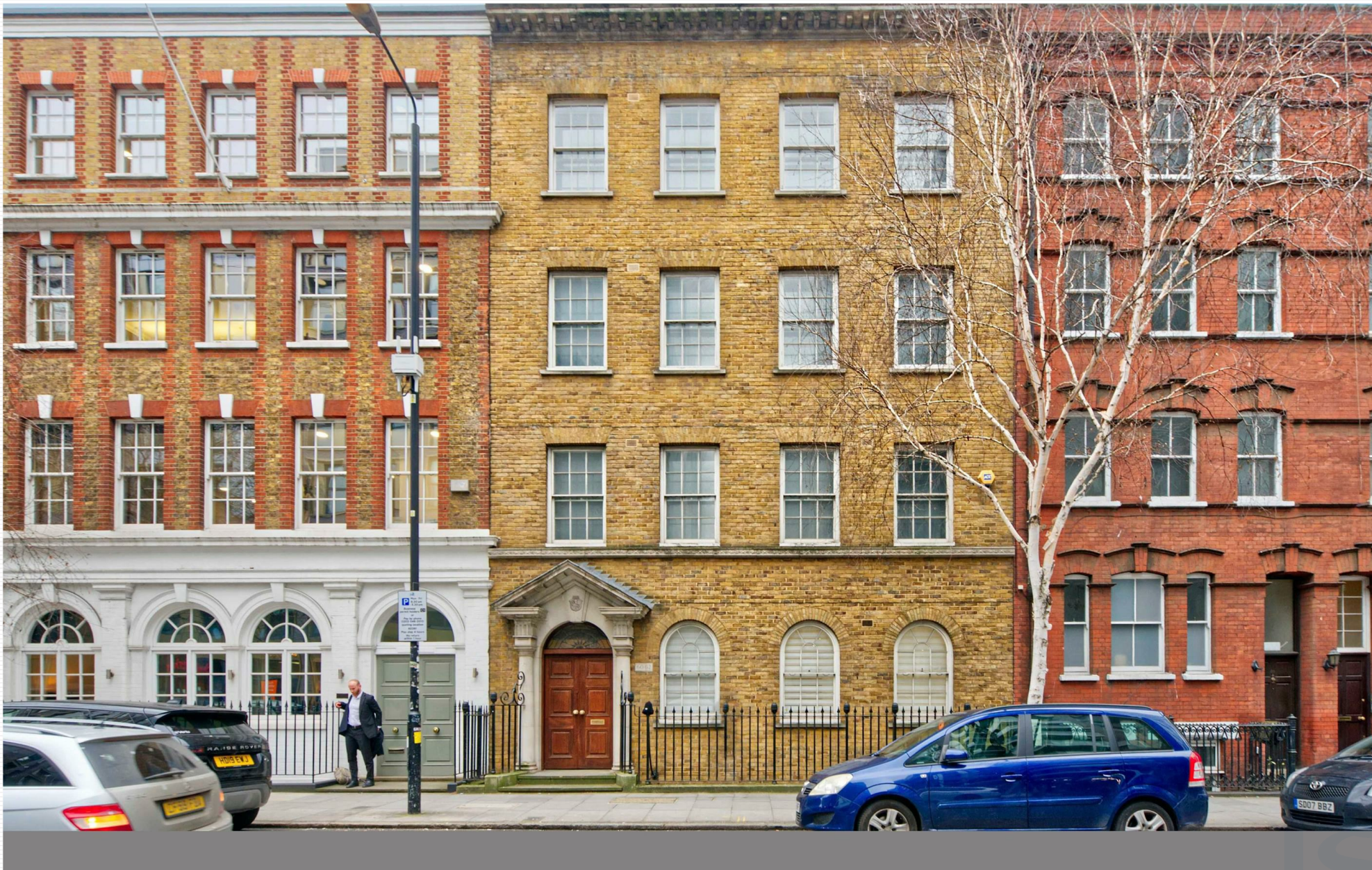
Leman Street, Whitechapel, E1 8EU