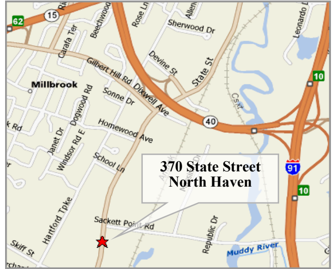
State Street near Sackett Point Road Convenient to I-91, Exit 10