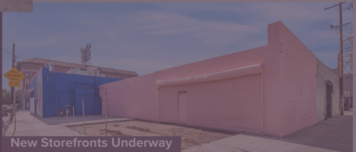
New Storefronts Underway

Heavily improved covered patio dining area w/ ABC enclosure