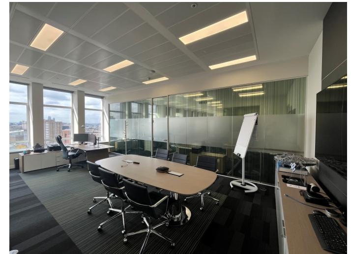
CEO Office / Board Room