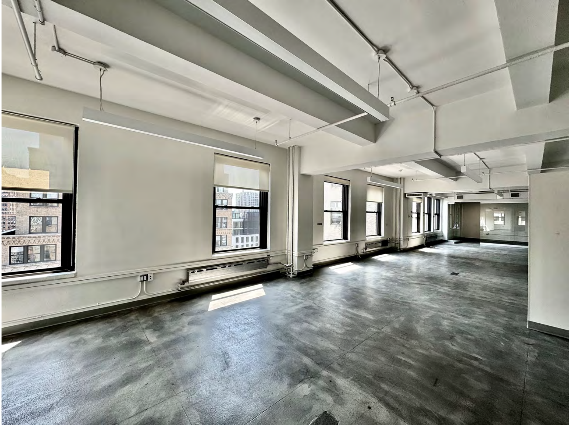
350 7th Avenue, Suite 2000 3,100 rentable sq. ft.