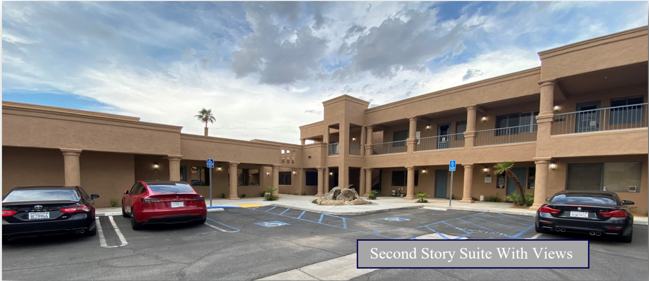
Second Story Suite With Views