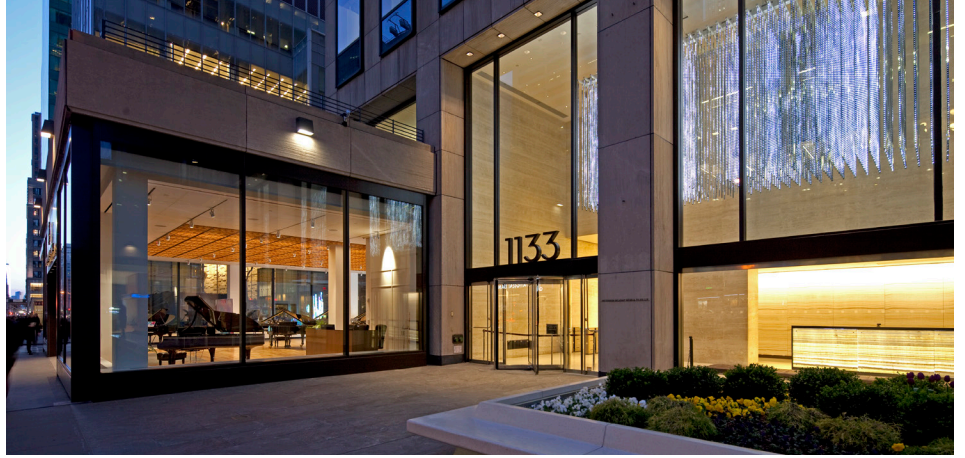
LANDSCAPED ENTRY PLAZA