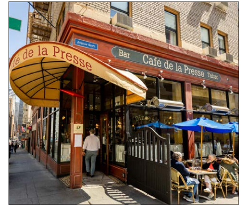
CAFE DE LA PRESSE