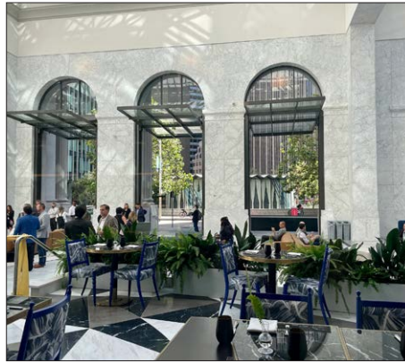
THE HOLBROOK HOUSE