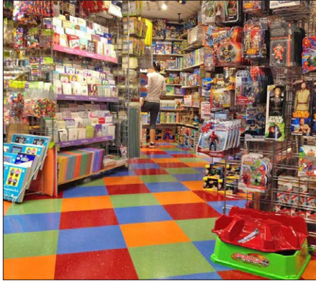
JUST FOR FUN