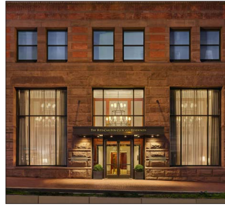
THE RITZ-CARLTON CLUB