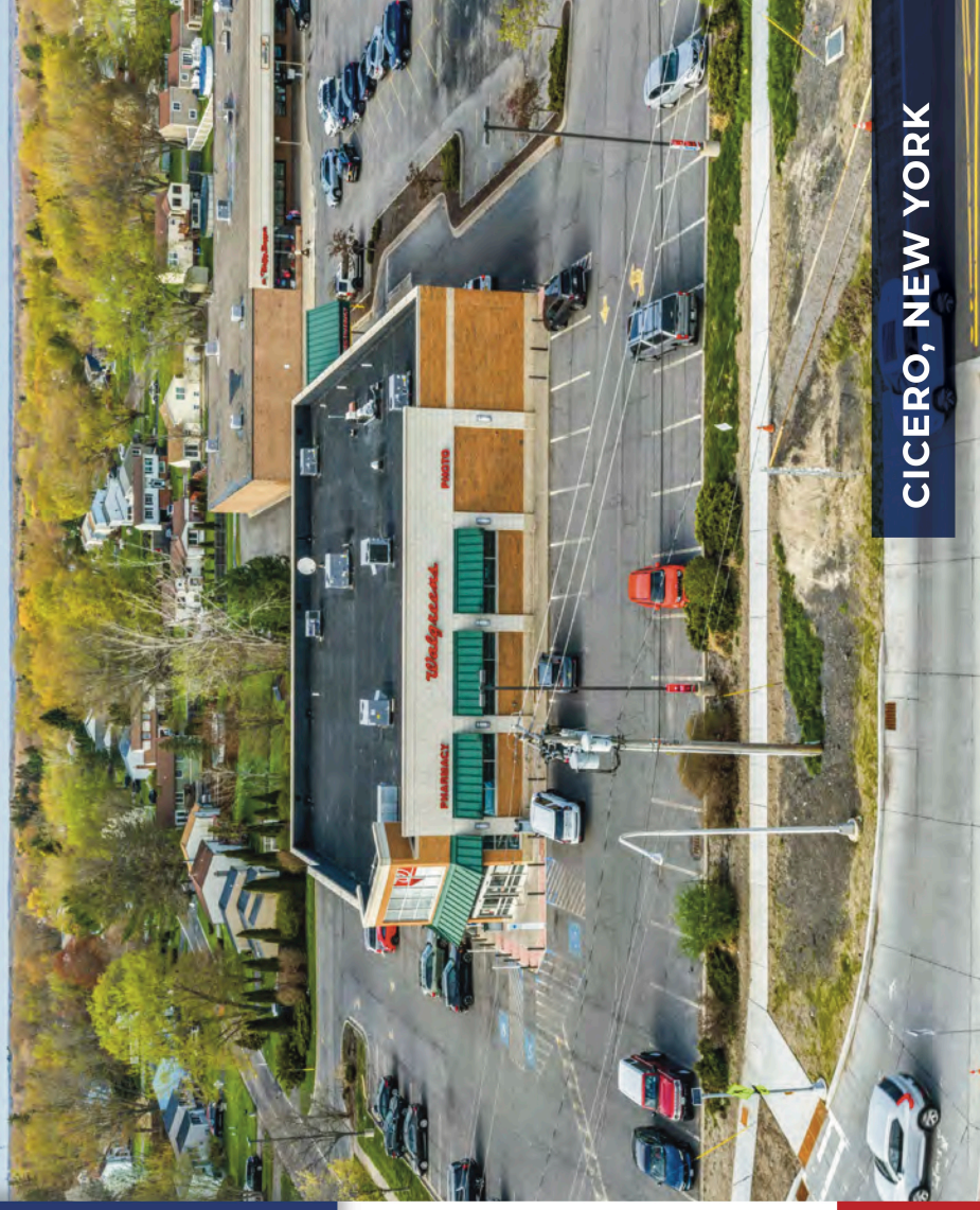
CICERO, NEW YORK

OFFERS DUE: MAY 28, 2026 BEST AND FINAL: JUN 4, 2026