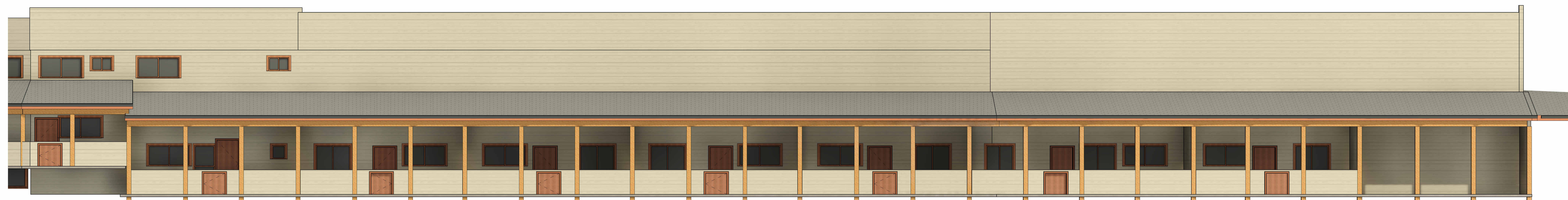
② Elevation 2 - a 1/8" = 1'-0"