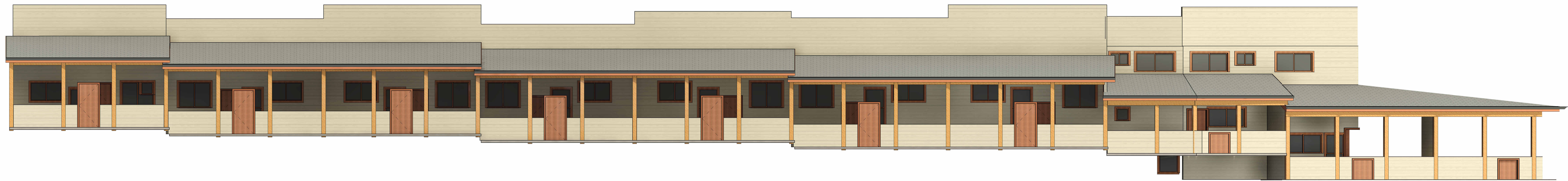
① Elevation 1 - a 1/8" = 1'-0"