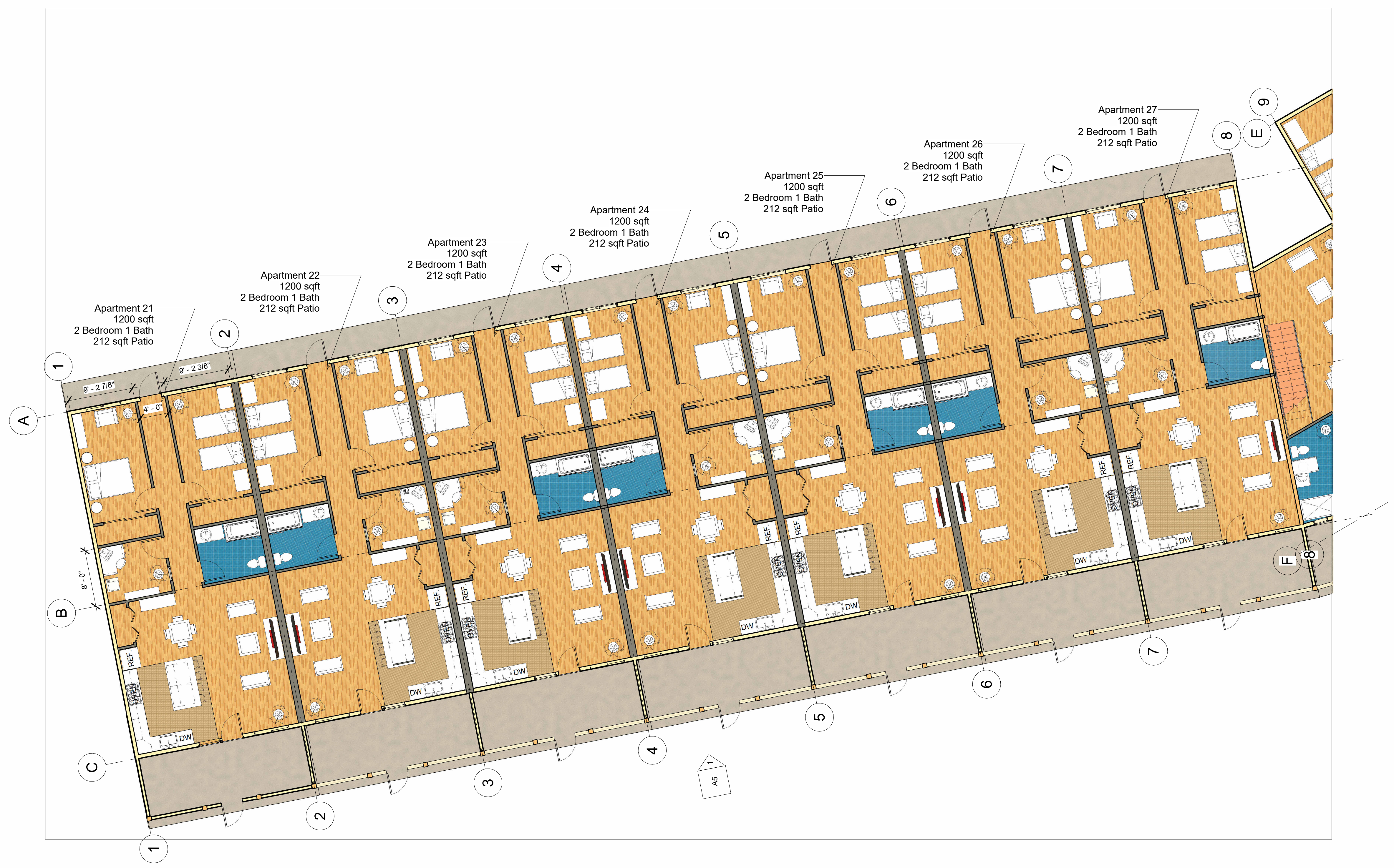
① First Floor, Single Level Apartments 1/8" = 1'-0"