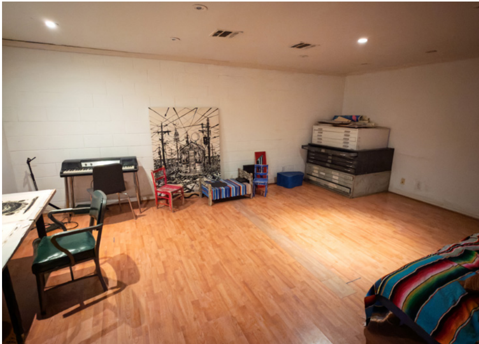
● 2nd office / studio on the ground floor