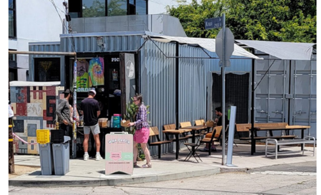
● Wax Paper Co.