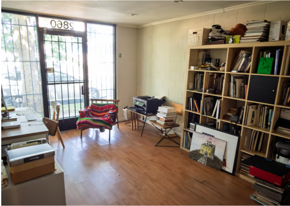
● Main office / reception with entrance from Glenview Ave