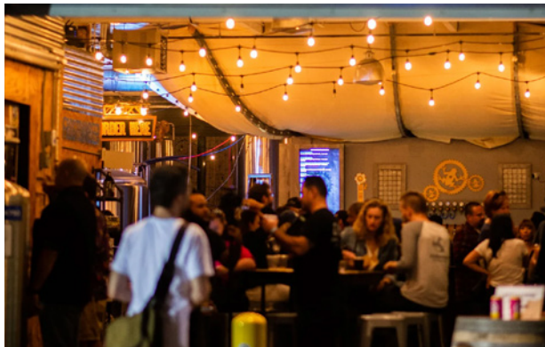
● Frogtown Brewery