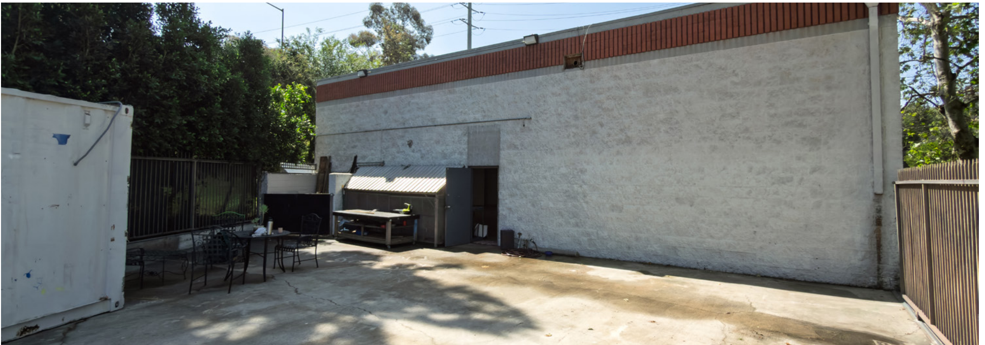
● The secure outdoor area and side entrance, along with the storage container