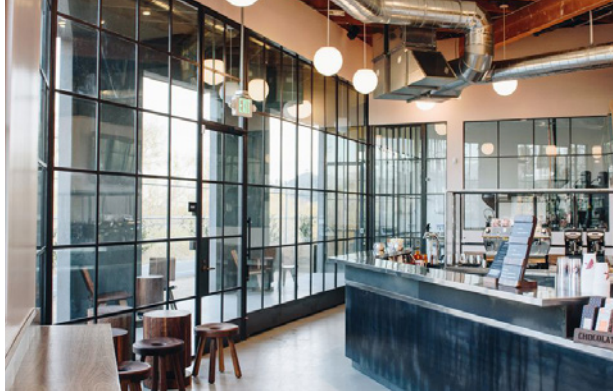
● La Colombe Coffee

2860 Glenview Ave sits at the eastern end of this corridor, walkable to Frogtown's signature destinations and within easy reach of Atwater Village and Silver Lake.