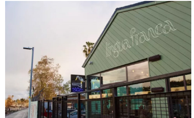
● Lingua Franca