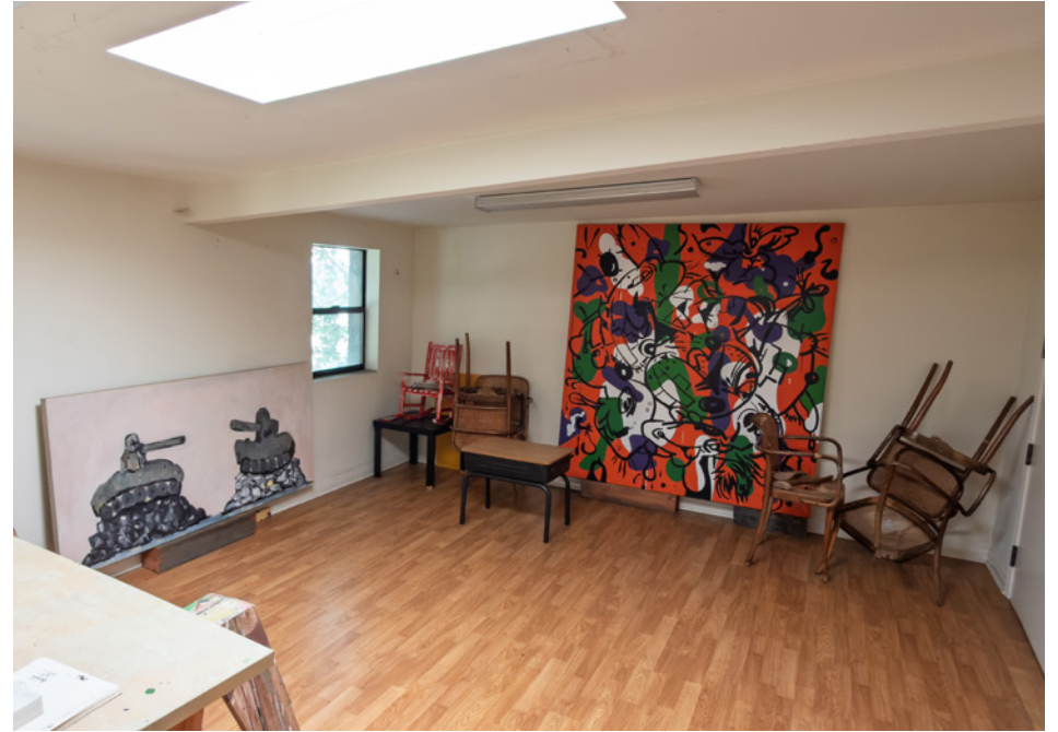
● 3rd office in the mezzanine