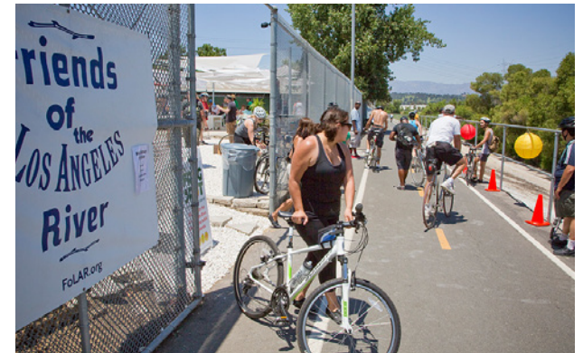
● Frogtown Art Walk