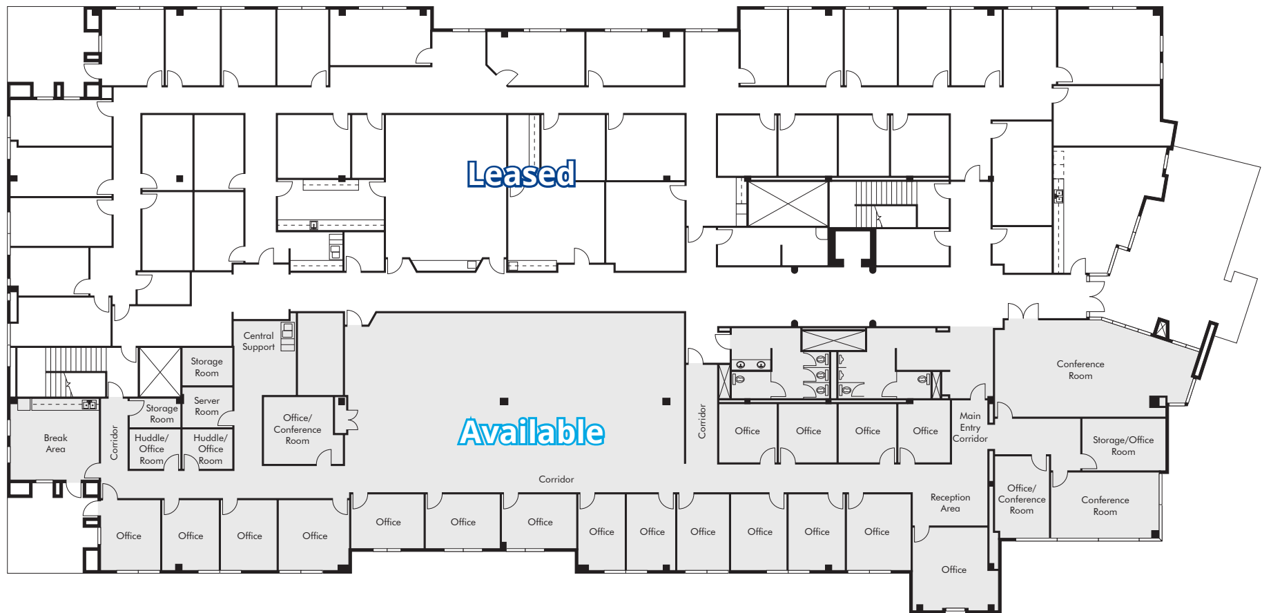
9600 MING AVE - 3RD FLOOR PLAN