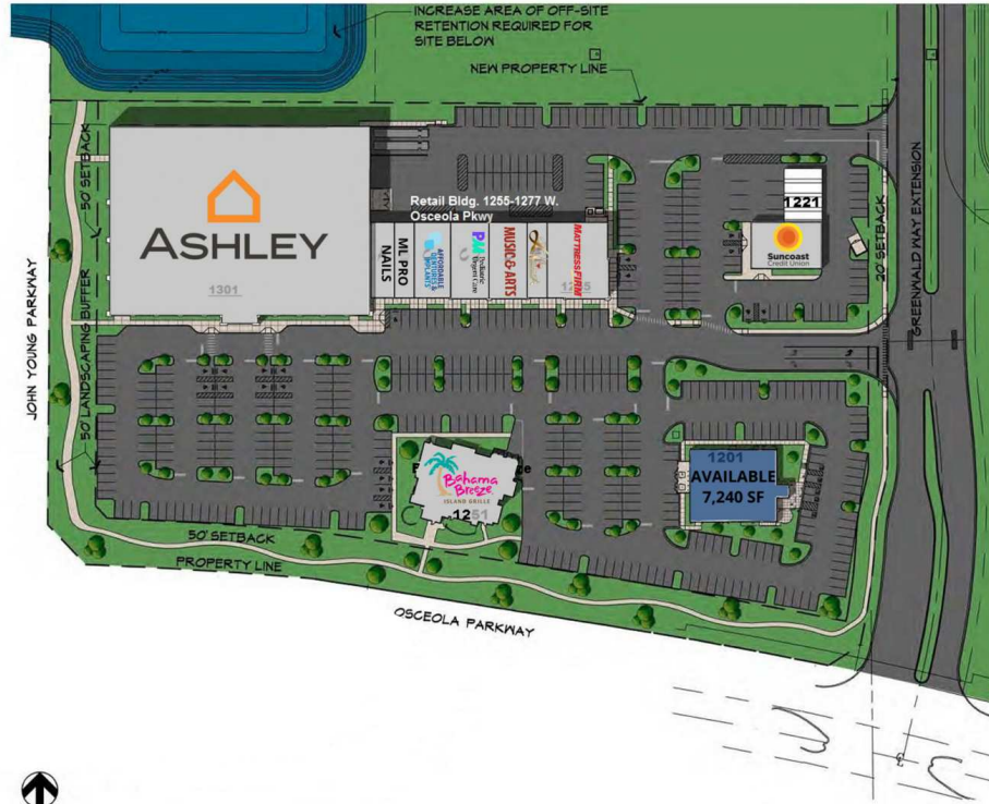
SITE PLAN SCALE: 1" = 100'-0"