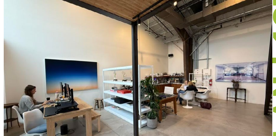
B— SUITE INTERIOR