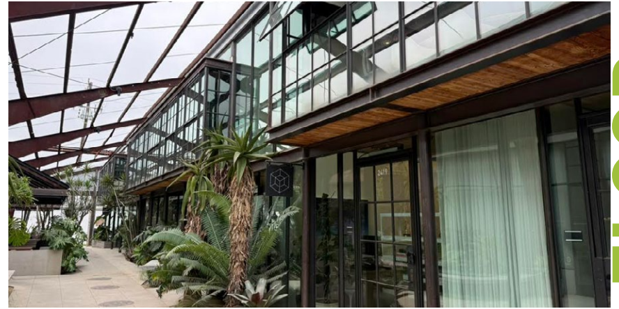
A— EXTERIOR ALLEY VIEW