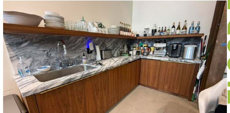
C— SUITE INTERIOR