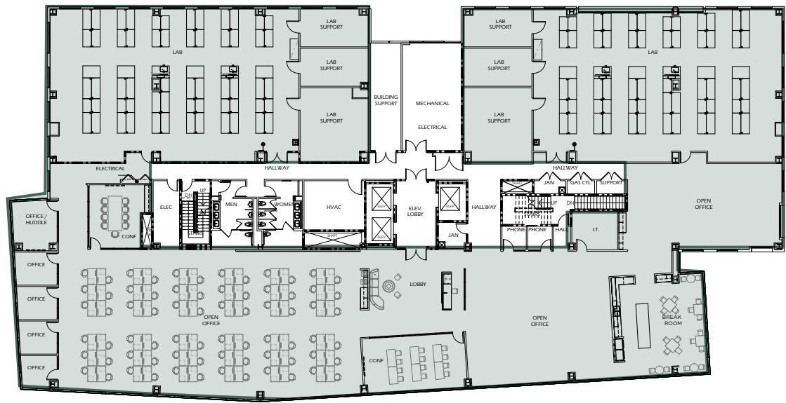
*FFE shown as conceptual.