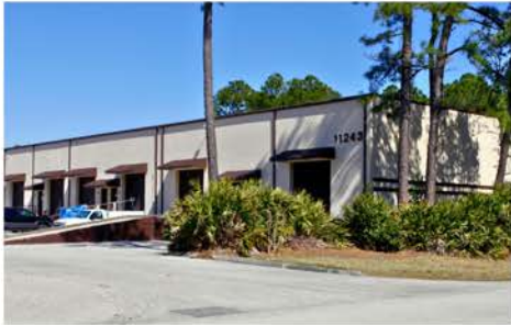
11243 ST. JOHNS INDUSTRIAL BLVD