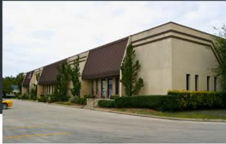
11222 ST. JOHNS INDUSTRIAL BLVD