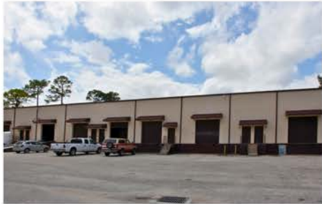
11233 ST. JOHNS INDUSTRIAL BLVD