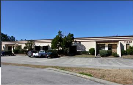
11232 ST. JOHNS INDUSTRIAL BLVD