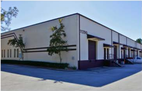
11290 ST. JOHNS INDUSTRIAL BLVD