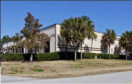
11233 ST. JOHNS INDUSTRIAL BLVD