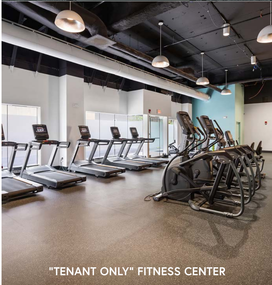
"TENANT ONLY" FITNESS CENTER