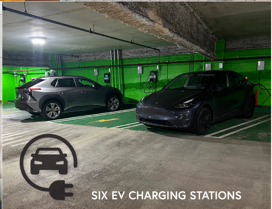
SIX EV CHARGING STATIONS