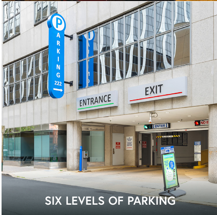
SIX LEVELS OF PARKING