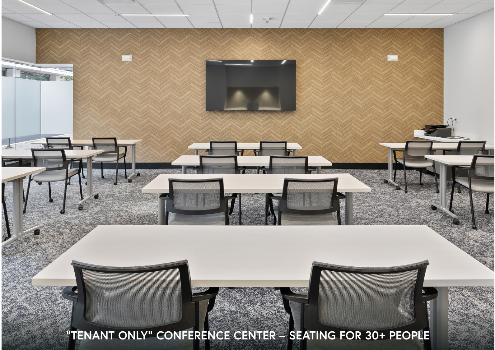
"TENANT ONLY" CONFERENCE CENTER – SEATING FOR 30+ PEOPLE