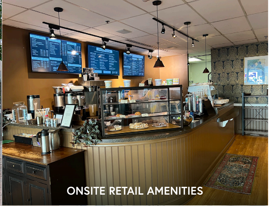
ONSITE RETAIL AMENITIES