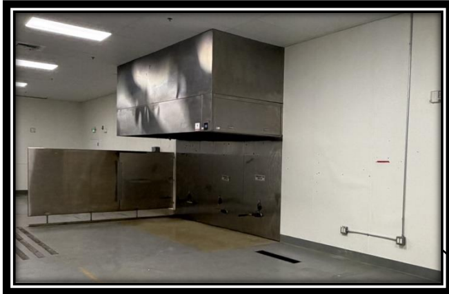
Hood + Grease Trap