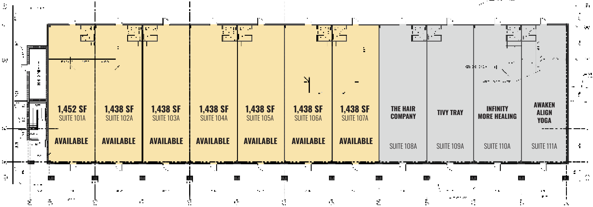
1ST FLOOR (RETAIL)