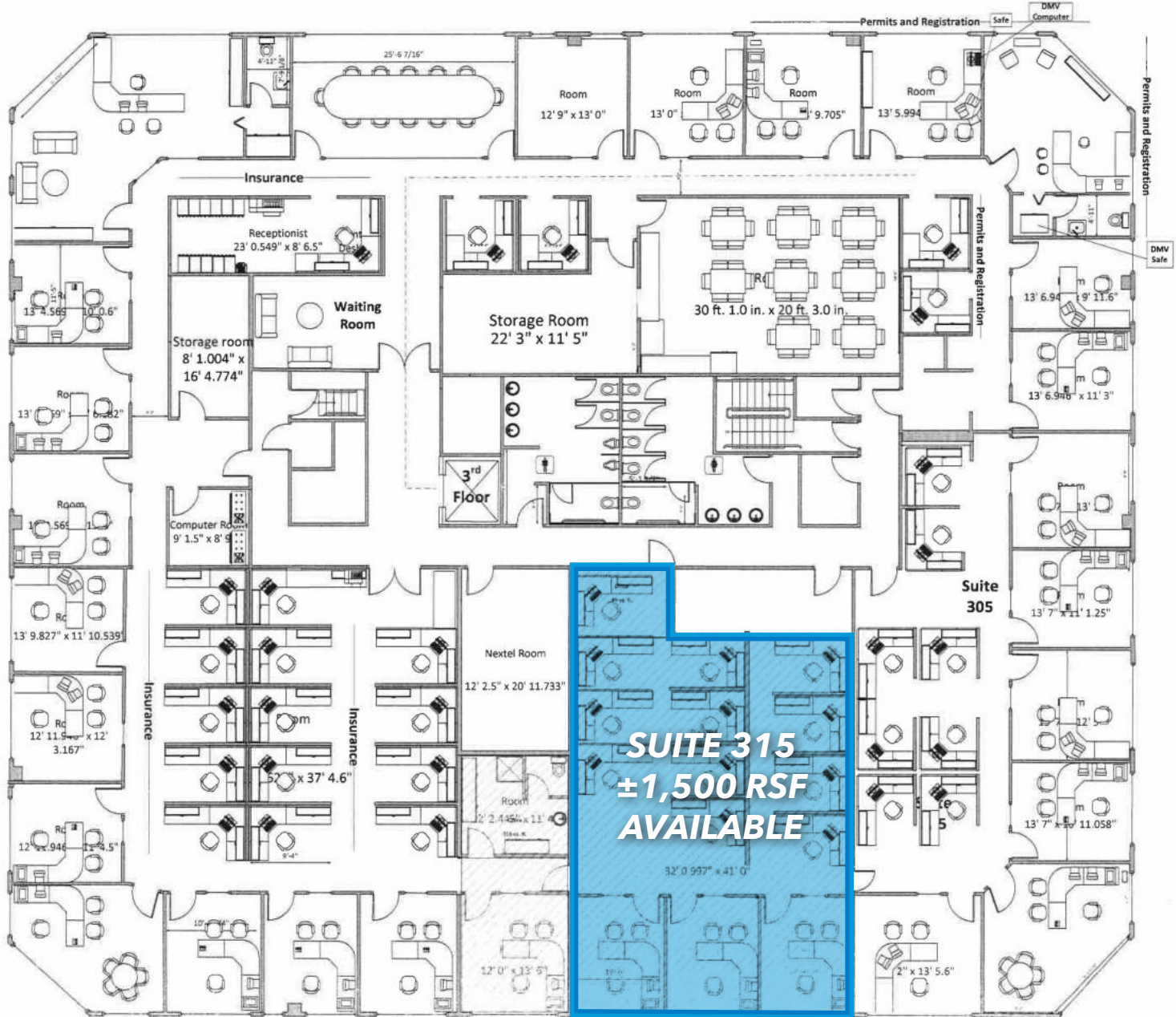
*floor plan not to scale

LOCAL EXPERTISE. INTERNATIONAL REACH. WORLD CLASS.