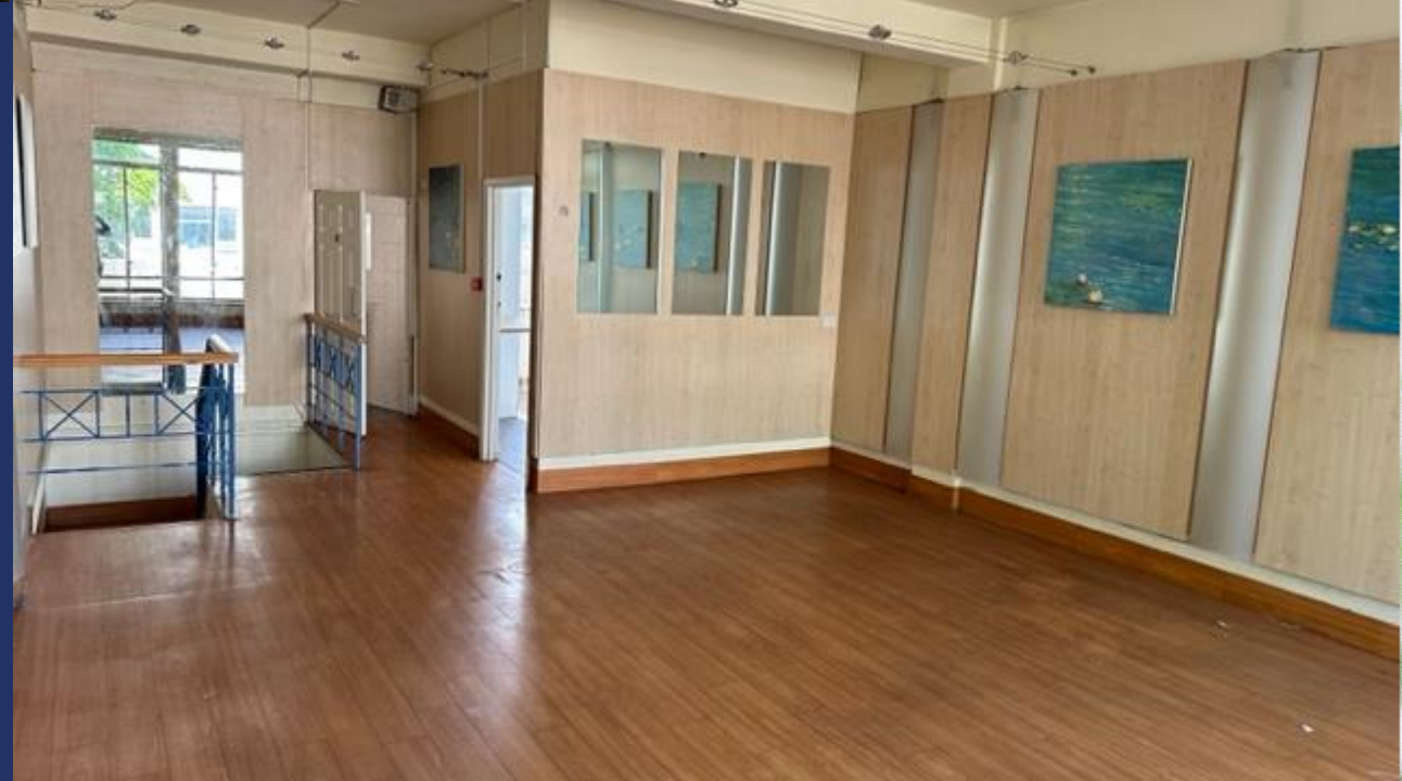
Second Floor Front of House