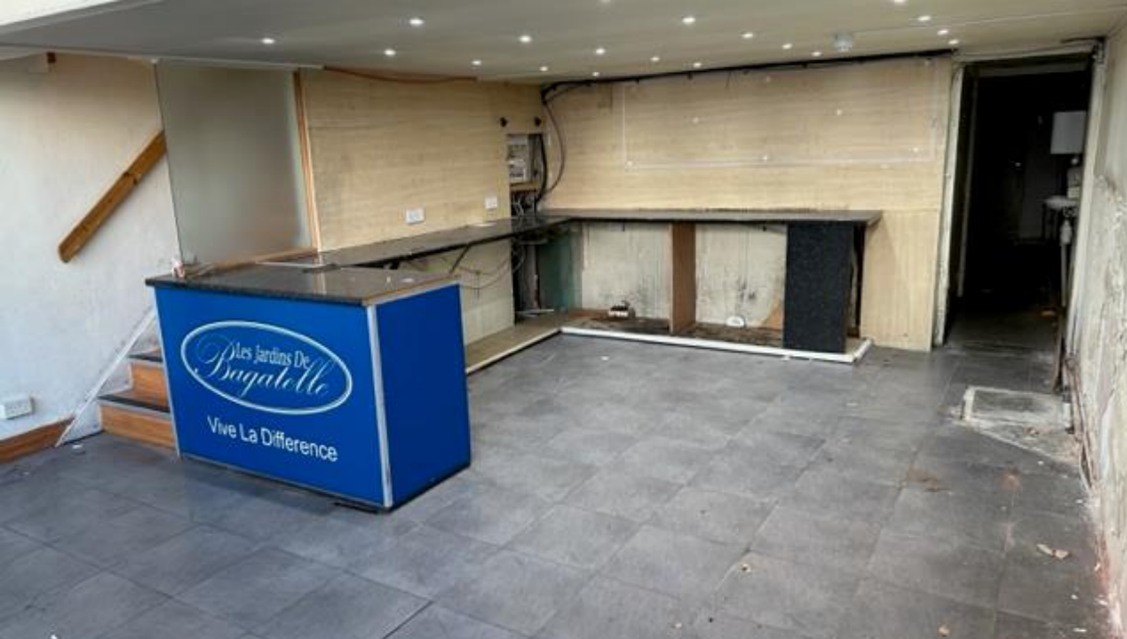
GROUND FLOOR FRONT OF HOUSE