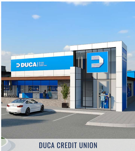
DUCA CREDIT UNION