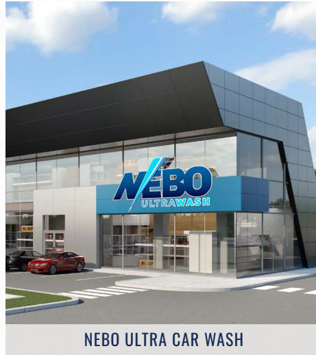
NEBO ULTRA CAR WASH