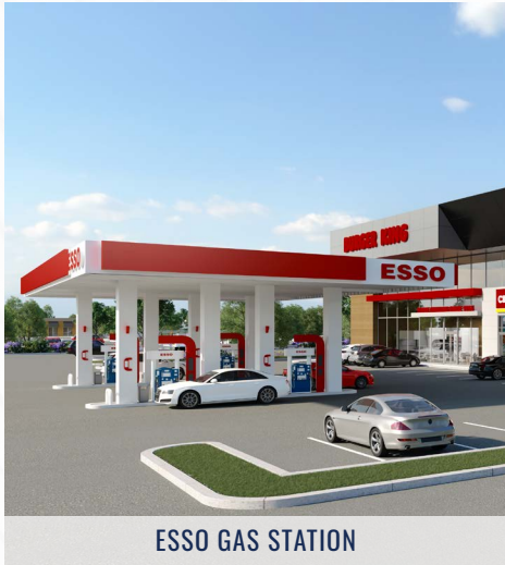
ESSO GAS STATION