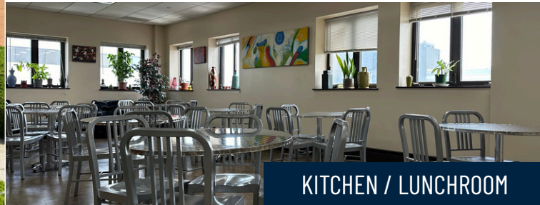
KITCHEN / LUNCHROOM