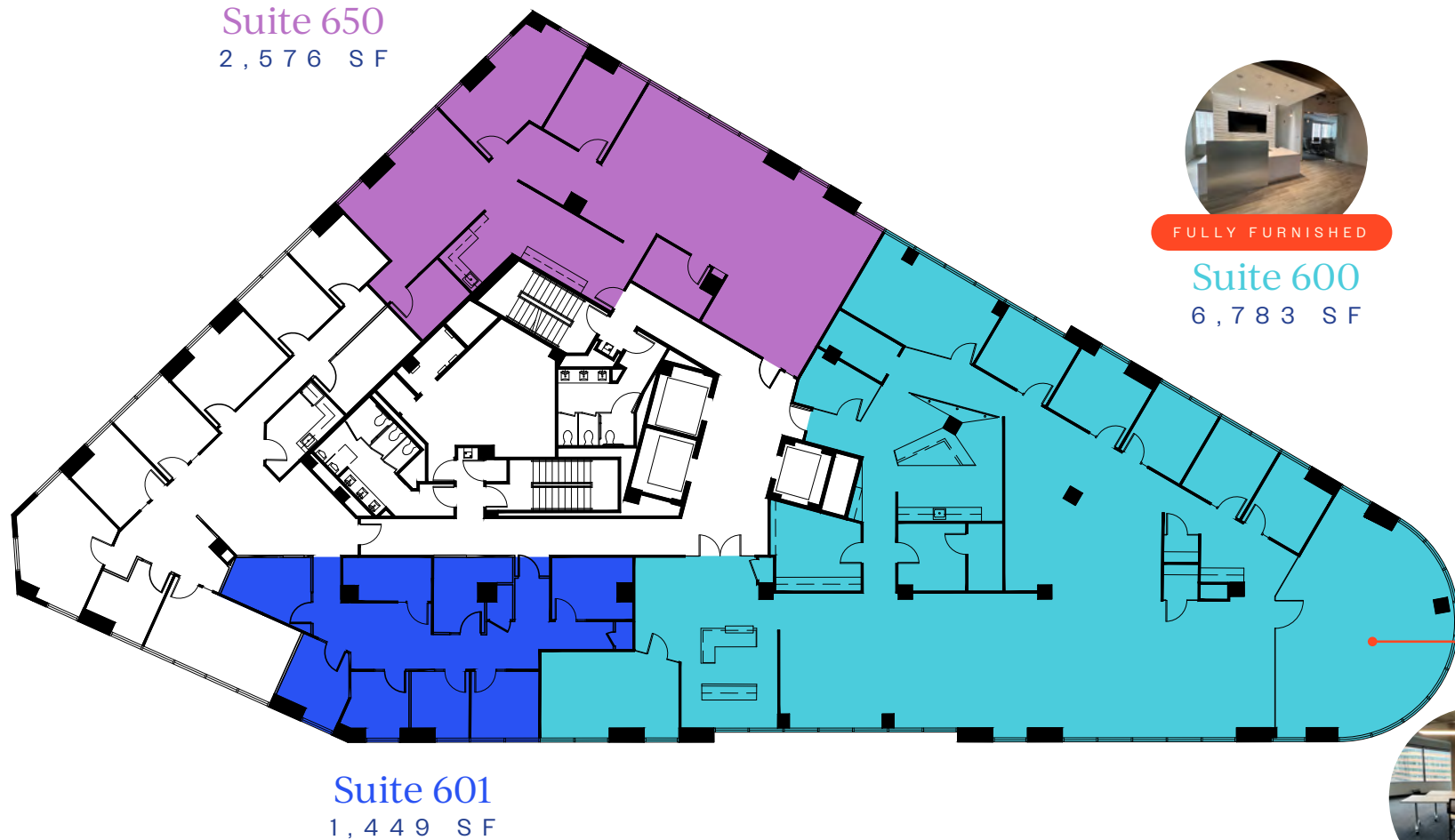
Suite 650 2,576 SF