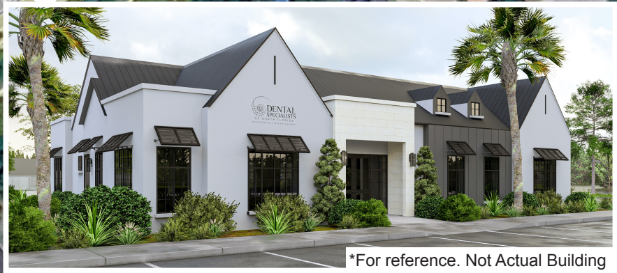
*For reference. Not Actual Building

Centrally positioned to serve the growing residential areas of Beachwalk, Palencia, Palm Valley, and Nocatee as well as the City of St. Augustine, FL.