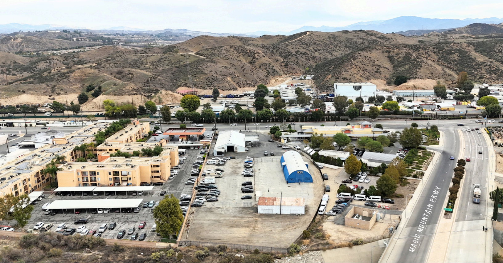
BUILDING 1 (FRONT BUILDING)