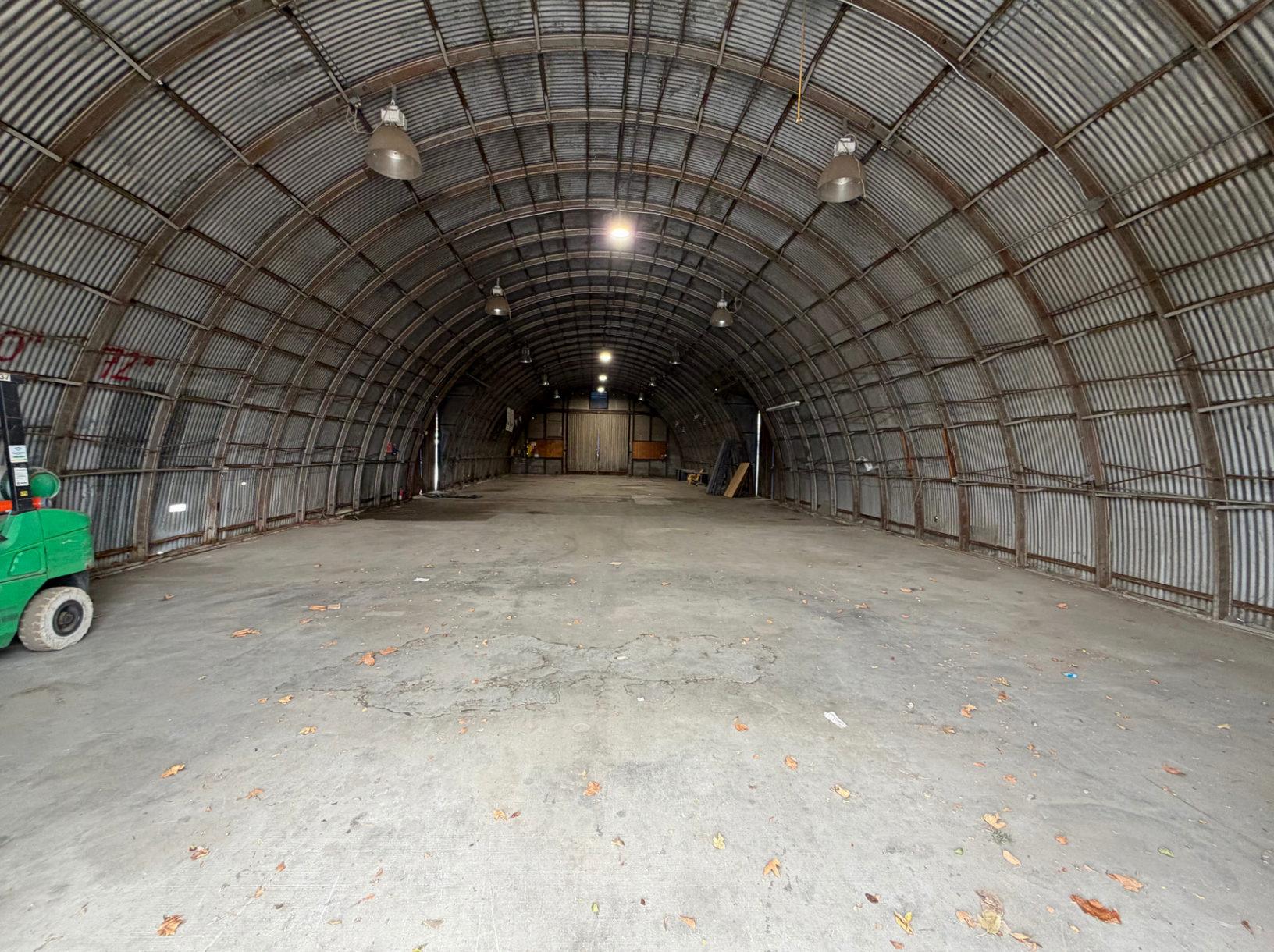
BUILDING 2 (BACK BUILDING)