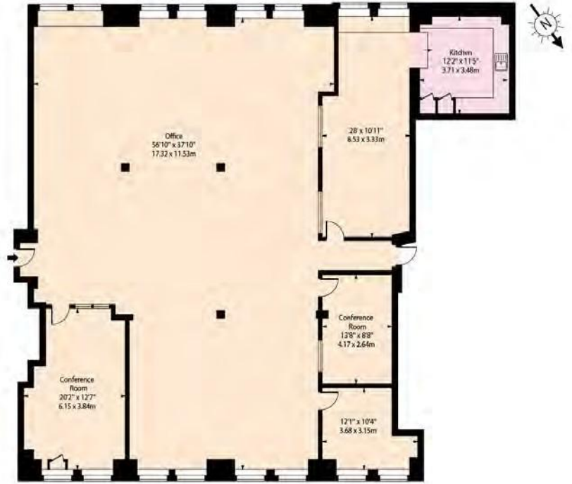
Lower Ground Floor - 2,770 sq ft