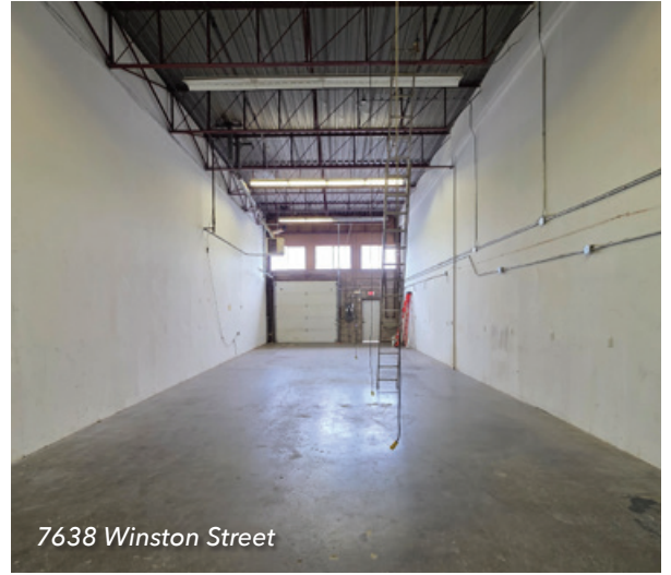
7638 Winston Street