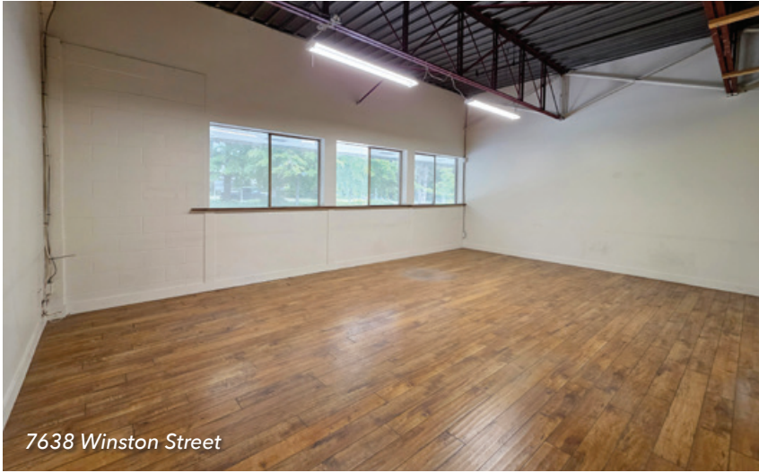
7638 Winston Street