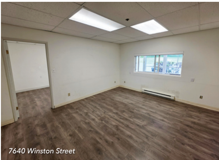
7640 Winston Street