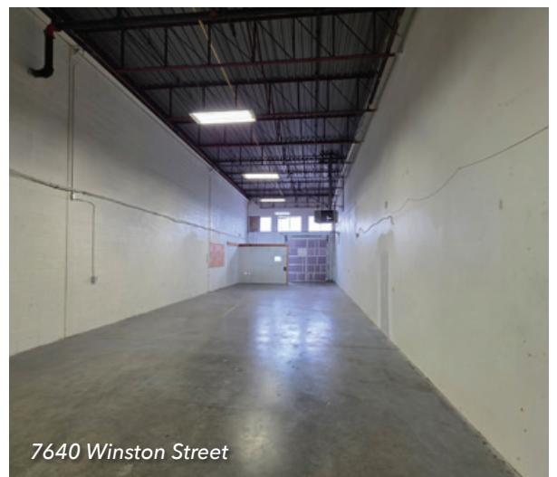
7640 Winston Street