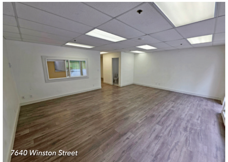
7640 Winston Street